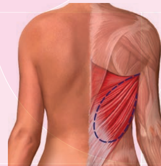
Latissimus Dorsi Procedure

Please visit www.myhopechest.org for complete video explanation of a reconstructive surgery.