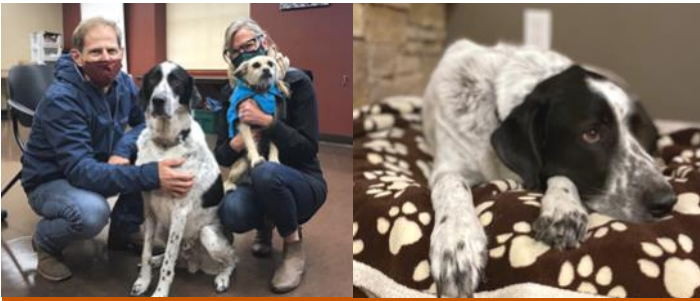
The Chance of a Lifetime - 5th and forever home