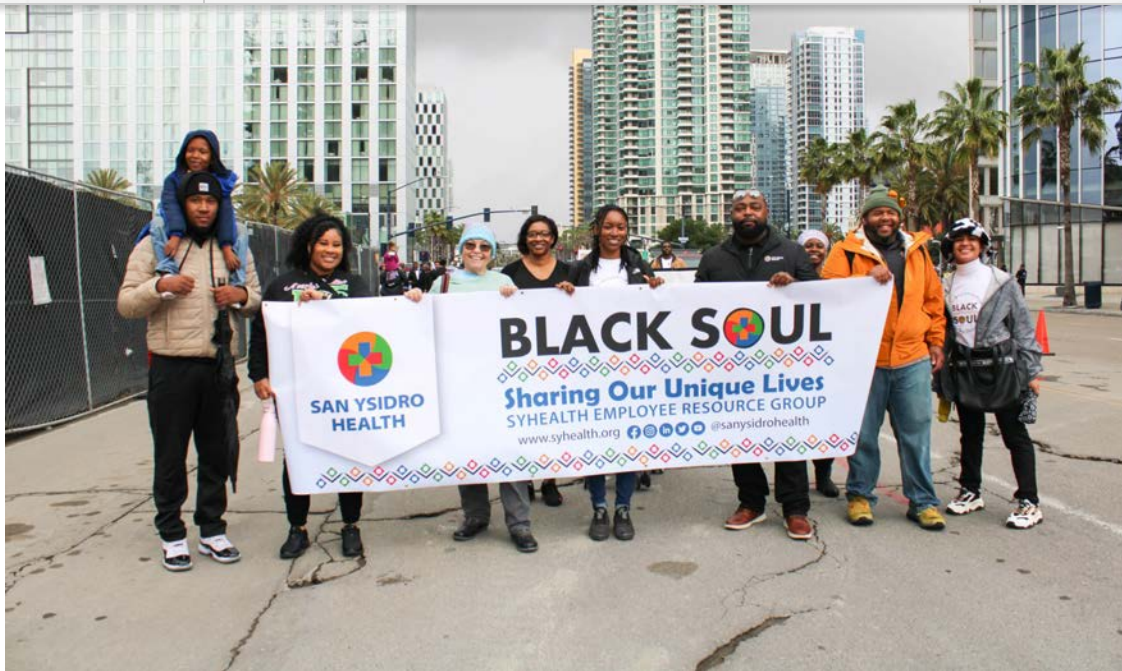
Pictured: San Ysidro Health's Black Soul ERG marching in the 41st Annual MLK Day Parade in Downtown San Diego

On Monday, January 16, we joined the nation in honoring the legacy of Dr. Martin Luther King, Jr – an American civil rights leader whose work focused on the values of equality, peace, and unity. We were so honored to have our Black Soul Employee Resource Group (ERG) represent San Ysidro Health at the 41st Annual Martin Luther King Jr. Parade on Sunday, Jan 15. Our commitment to Diversity, Equity, Inclusion, and Belonging (DEIB) guides the way we provide compassionate care to the over 145,000 lives in our care.