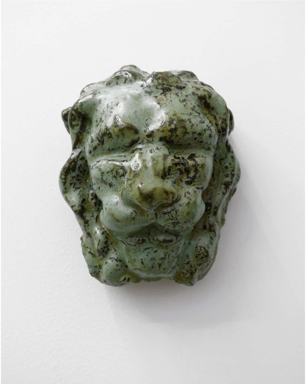
Lion head, 2020 glazed ceramic 16 x 13.5 x 10cm