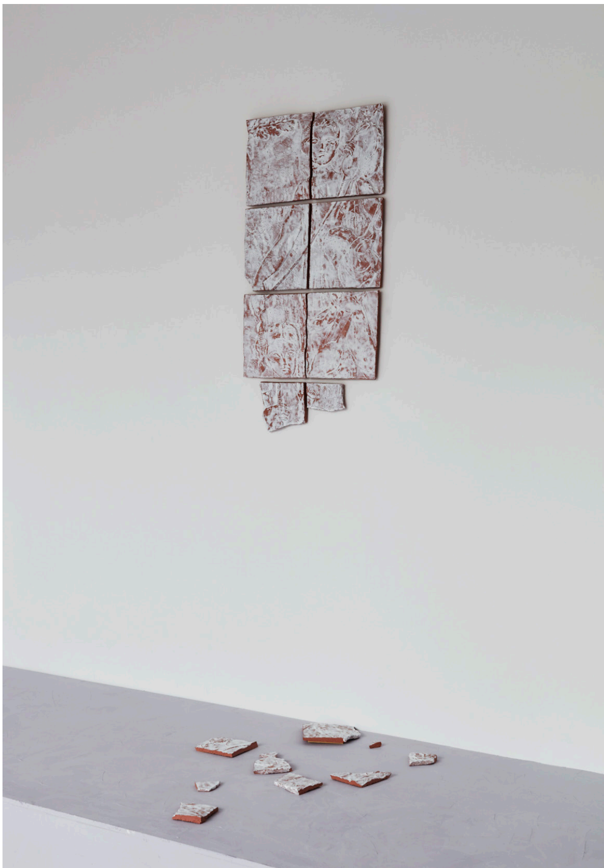
After Milița Petrașcu, 2020 glazed ceramic 100 x 46 x 2.5cm