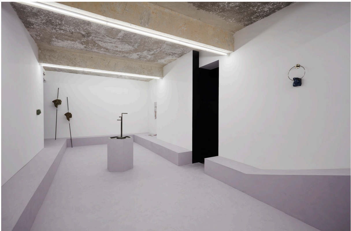
Installation views The Near and the Elsewhere