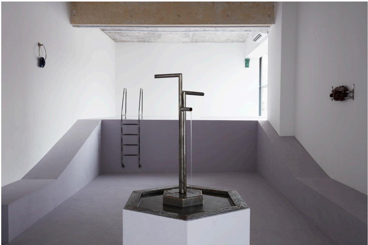
Fountain no.3, 2020 steel, wood, paint, water 164 x 66 x 76cm