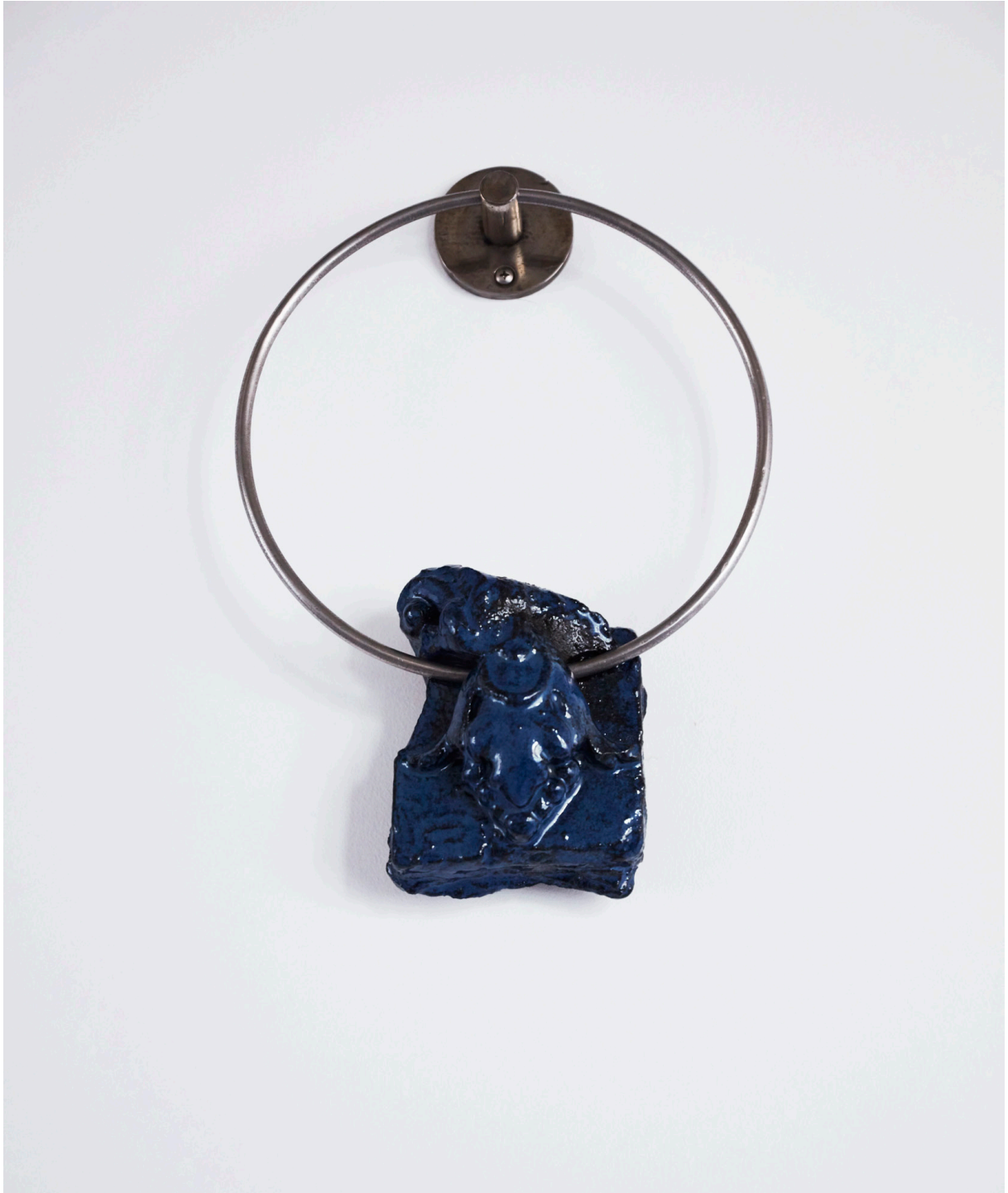
Shiver, 2020 glazed ceramic, nickel plated steel 40 x 27 x 8cm