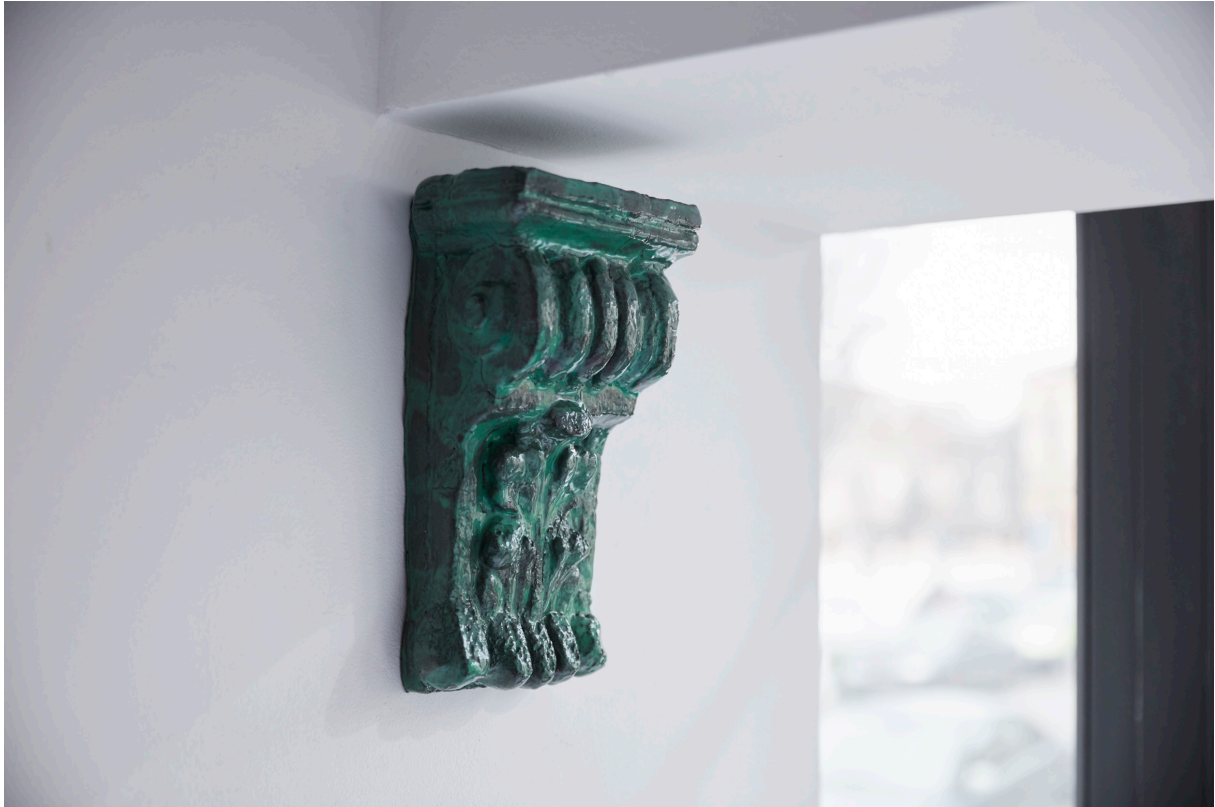
Stay, 2020 glazed ceramic 28 x 18 x 10.5cm