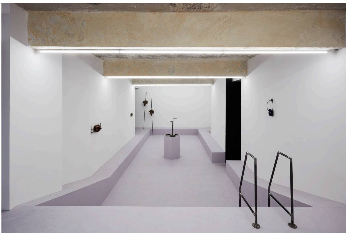
Installation views The Near and the Elsewhere