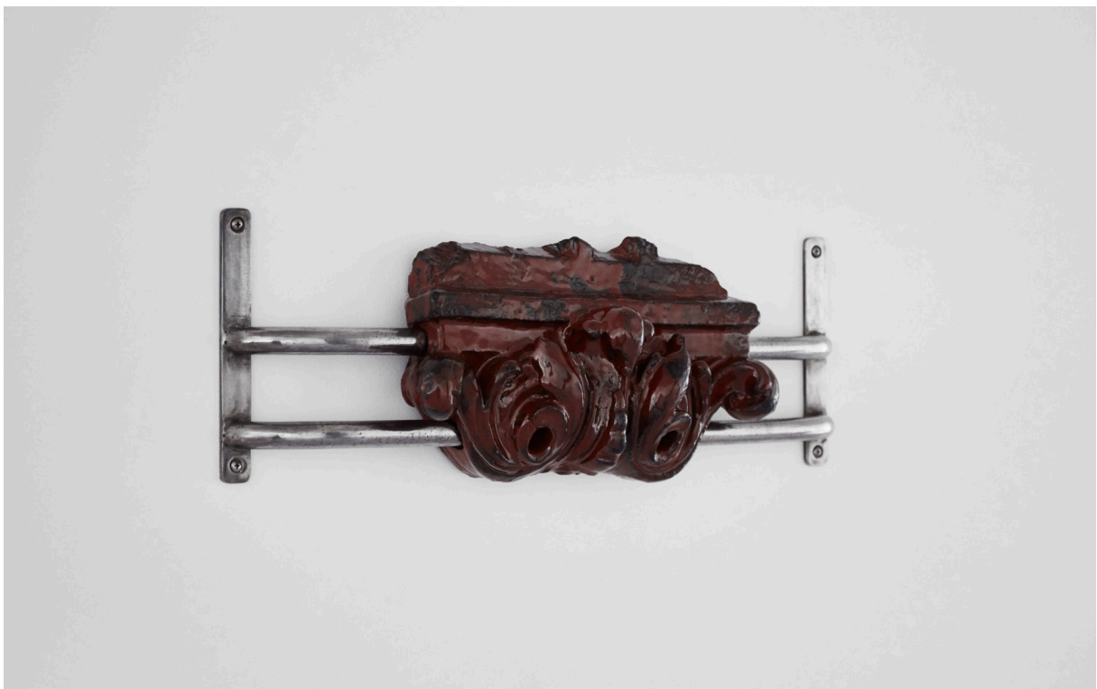
Dragon, 2020 glazed ceramic 16 x 13.5 x 10cm