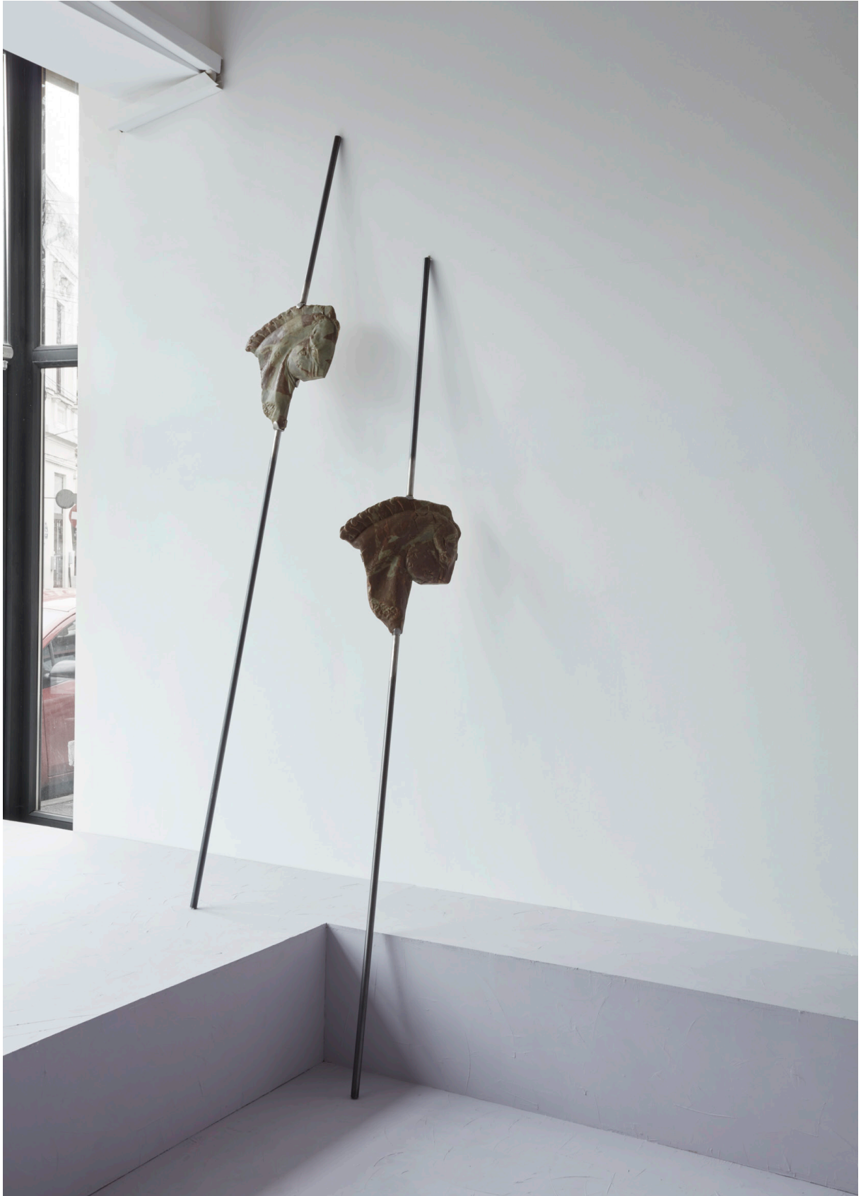
Alice & Remus, 2020 glazed ceramic, steel 300 x 80 x 60cm