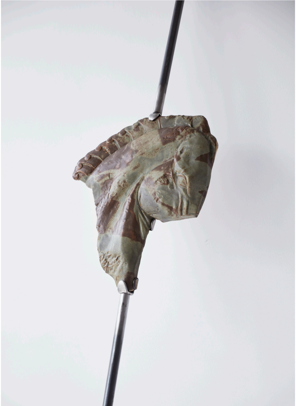
Alice & Remus (detail), 2020 glazed ceramic, steel 300 x 80 x 60cm