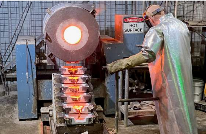
Gold pour at Karora's Higginsville operations

ORIC is the Office of the Registrar of Indigenous Corporations. ORIC supports and regulates Indigenous corporations that are incorporated under the Act. Ngadju Native Title Aboriginal Corporation reports to ORIC on a regular basis, and you can view details of the corporation by searching on ORIC's website www.oric.gov.au , using our ICN 8297.