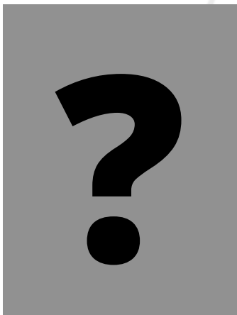
Currently Recruiting Governance, Communication and Membership Officer