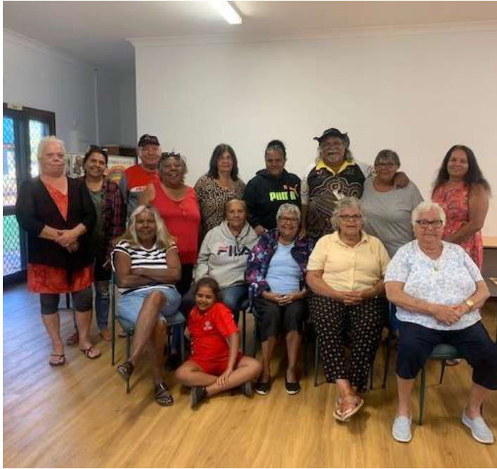
Yarning Circles in Geraldton

Yarning Circles are a great opportunity to meet our mob and chat with NNTAC staff and management. You can discuss areas of the business, surveys, heritage, membership, the Rule Book and Native Title. We would love to see you so come along at any of the below times and I look forward to meeting a lot more of NNTAC'S members.