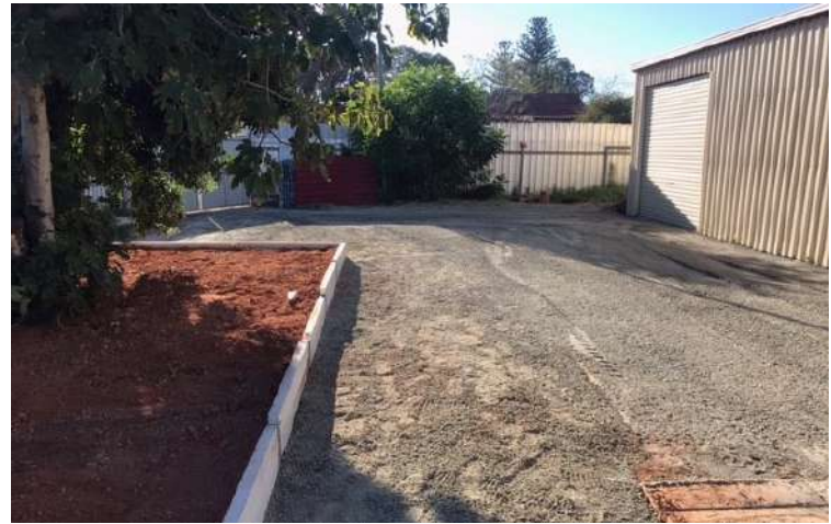
Outdoor area behind the Post Office

The current plan is for the Post Office to be used as a multi-use facility by NNTAC. It will act as an office for NNTAC staff based in the Goldfields and will be open 5 days a week for local Ngadju people to get assistance with forms, resumes and other administrative tasks. It will also be used as a base for heritage surveys departing from Norseman. There will also be a meeting room set up from which the Board and Elders will hold their meetings in Norseman. Perth office staff will also be encouraged to work from this office whenever convenient. The front room of the Post Office is planned to be an area where Ngadju history and memorabilia can be displayed. This area will require significant planning however, before it is ready and may not be ready at the same time as the office opens.