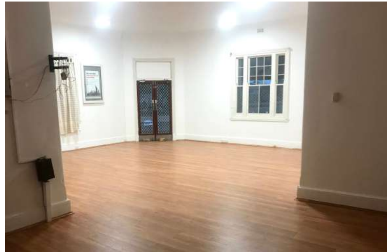
Inside the main room at the Post Office