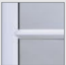
25. Putty line plant on bar external (Authentic Only)