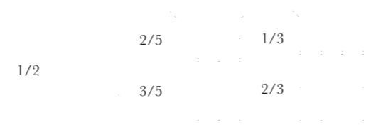
Variable Transom Drop Positions available to all windows