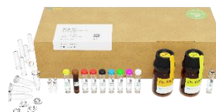
Fig. 2: ENRICH-iST Kit (displayed in environmentally friendly packaging) is available as an 8x version or as a 96x version for high-throughput plasma proteomics.