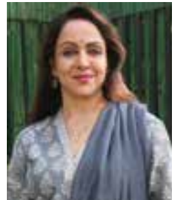
HEMA MALINI INDEPENDENT DIRECTOR