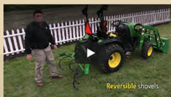
How To Use A One-Row Cultivator