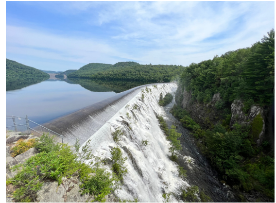
Goodwin Dam spillway in action after historic rainfalls in 2023

FRWA was lucky to be at the table to assist with the effort to protect MDC's Colebrook Reservoir Lands. In July 2023, MDC signed an agreement to sell a conservation easement for 5,500 acres of MDC's Colebrook Reservoir lands to Northwest Connecticut Land Conservancy if the Connecticut DPH approves MDC's abandonment permit application. This is a historic win for the Farmington River Community as it preserves those 5,500 acres as forested habitat and preserves the watershed with the same protections that drinking water reservoirs across the state have.