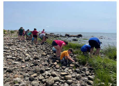
ELCCT Water Wanderers looking for crabs on Hammonasset Beach