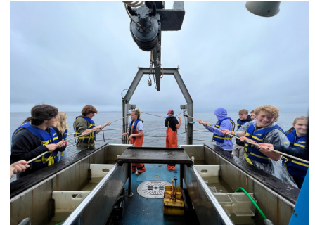
BEHS students learn about marine research aboard the Enviro Lab II