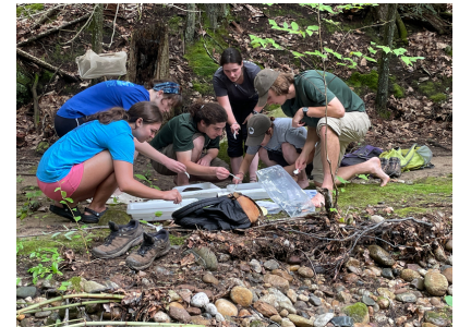
FRWA and McLean Game Refuge interns sorting aquatic insects

This fall, FRWA has trained 28 volunteers to assist in assessment of streams following the CT DEEP RBV (Riffle Bioassessment for Volunteers) Protocol. Using aquatic macroinvertebrate assessments, CT DEEP is able to identify high quality stream habitats. FRWA has submitted 10 samples to CT DEEP, and the results will be published in an annual report.