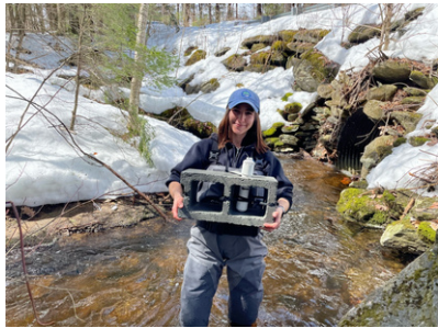
FRWA Staff deploying a conductivity logger in Becket, MA

FRWA installed 3 new temperature loggers in Massachusetts, to accompany work being done with our Berkshire Clean, Cold, and Connected (BCCC) partnership. In Connecticut, 18 loggers were retrieved and 17 were redeployed throughout the Farmington River and its tributaries.