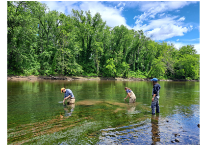
Summer Interns learning how to take bacteria samples

From June through September, FRWA staff, interns, and one volunteer monitored 59 sites for E.coli . There are 17 sites in Massachusetts and 42 in Connecticut, spanning the entire watershed. We extend our gratitude to the Town of Simsbury's Water Pollution Control Authority for allowing us to utilize their lab to analyze our samples.