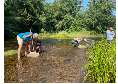
Volunteers leaning how to sample aquatic insects at our RBV training in Salmon Brook

FRWA continued the Water Wanderer's camp program with Environmental Learning Centers of CT, which brought a group of kids down to Long Island Sound to learn about the diverse habitats. FRWA also continued its partnership with Bristol Eastern High School, who participate in rain gardens plantings and upkeep, along with taking a trip to Project Oceanology where they learned about marine research on LIS, and got up close with some cool marine organisms. This summer, FRWA also hosted paddles with youth groups, including ELCCT and NAG, to get people out on the water and learning about our river.