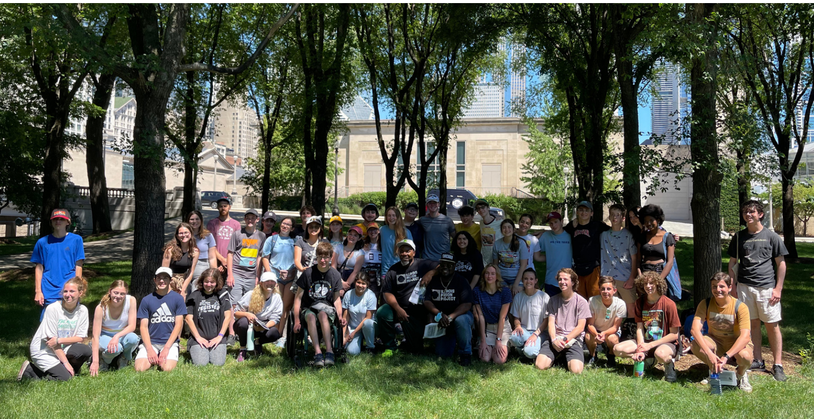
The IPP Education Team (center) hosts workshops for community organizations, school groups and more on the history and legacy of mass incarceration.