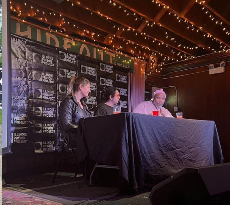
Left: Ambassadors during a voter registration canvass. Right: A panel discussion hosted by IPP about voting in prison.