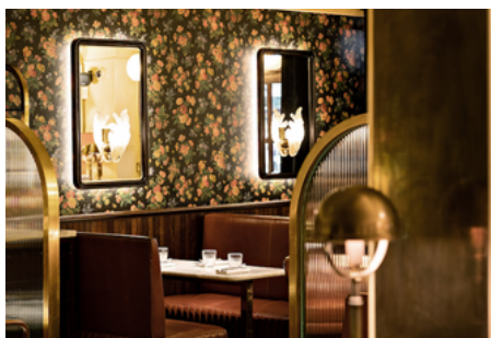
AUX PRES CYRIL LIGNAC

Modern-rustic brasserie nestled in a green courtyard offering a creative menu