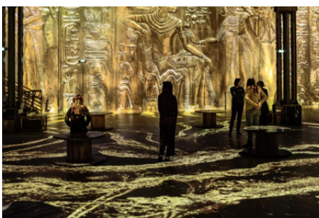
L'EGYPTE DES PHARAONS, DE KHÉOPS À RAMSÈS II