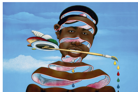
CHERI SAMBA DANS LA COLLECTION JEAN PIGOZZI Musée Maillol