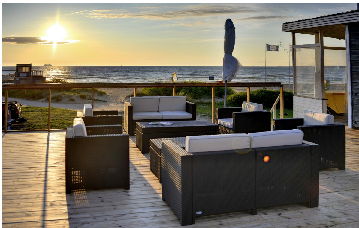
Surf Club, Tallinn, Estonia

Arizona 26x115mm, D30, thermo-treated pine