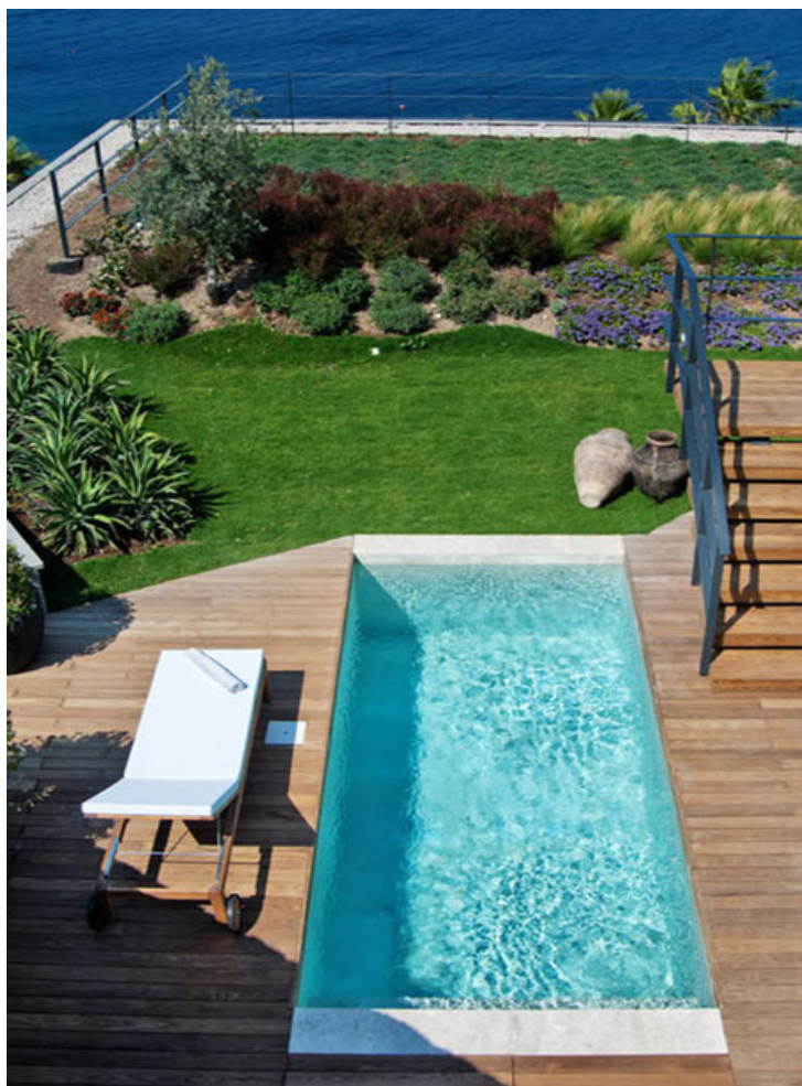
Beach resort in Bodrum, Turkey Karakum 20x95mm, profile D11sg