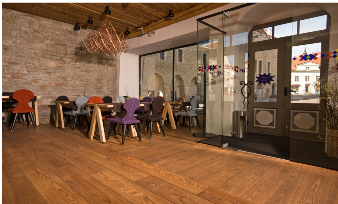
Restaurant in Tallinn, Estonia (Kaerajaan) Salsa 18x190mm, medium-treated ash