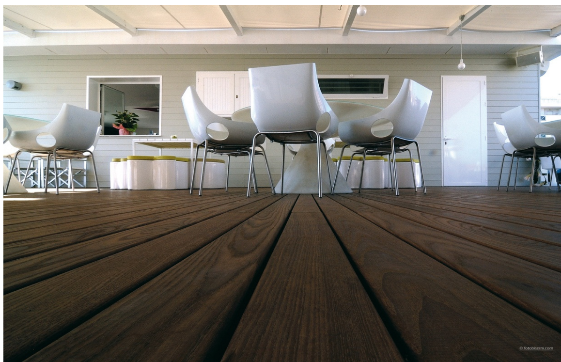
Beach resort Milano Marittima, Italy Karakum 20x95mm, profile D11sg