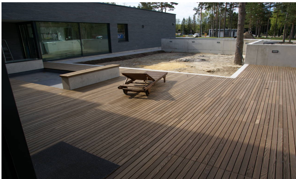
Private villa in Tallinn, Estonia Karakum 20x95mm, D11sg