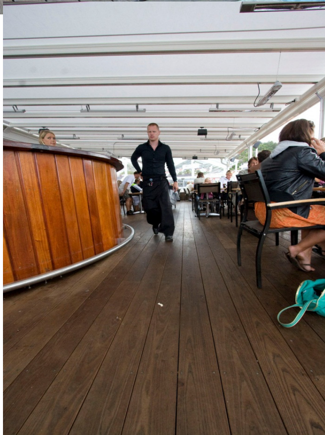
Restaurant in Norway Karakum 26x160mm, D4