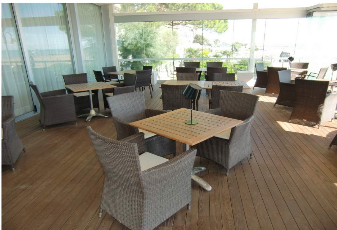
Hotel Atlantico, Jesolo, Italy Karakum 20x95mm, profile D4