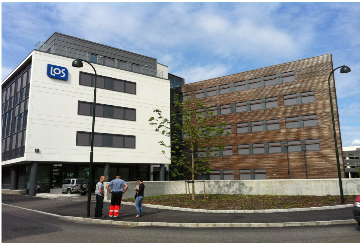
Office building in Norway

Dubai 20x65mm, rhombus, thermo-treated ash