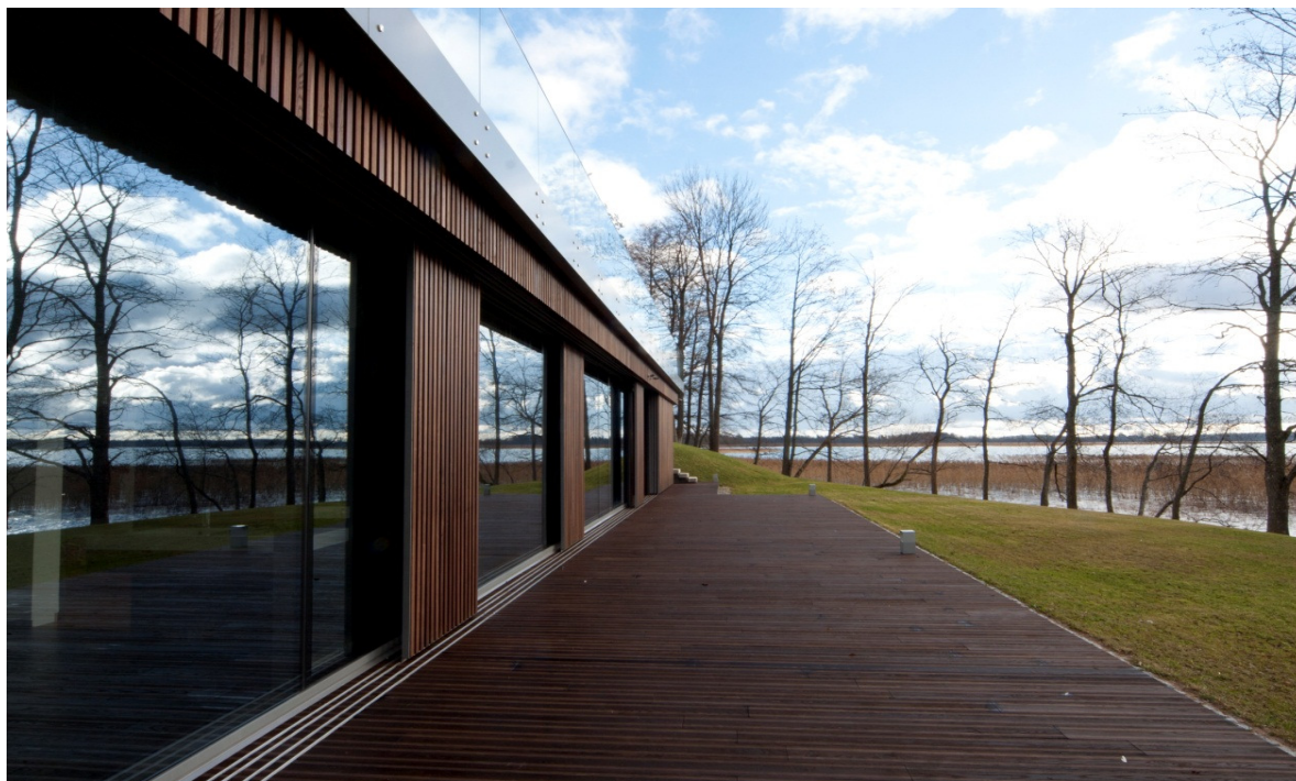
Private villa in Aluksne, Latvia Karakum 20x150mm, D8