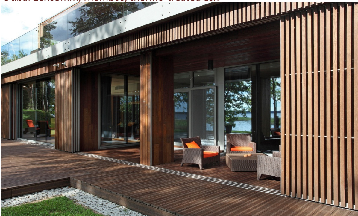
Private villa in Aluksne, Latvia

Dubai 20x65mm, rhombus, thermo-treated ash