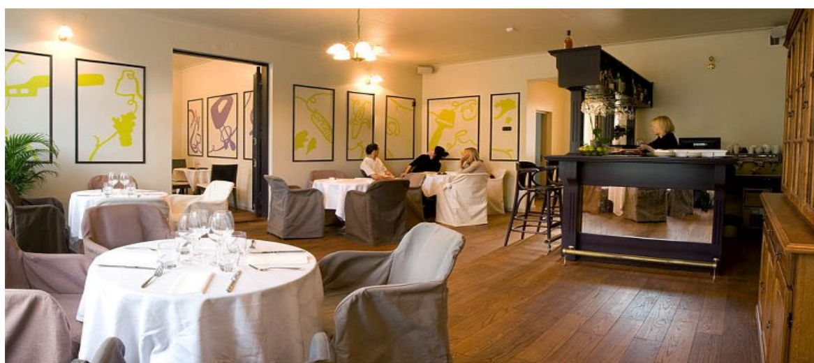
Restaurant in Tallinn, Estonia (Neikid Resto)