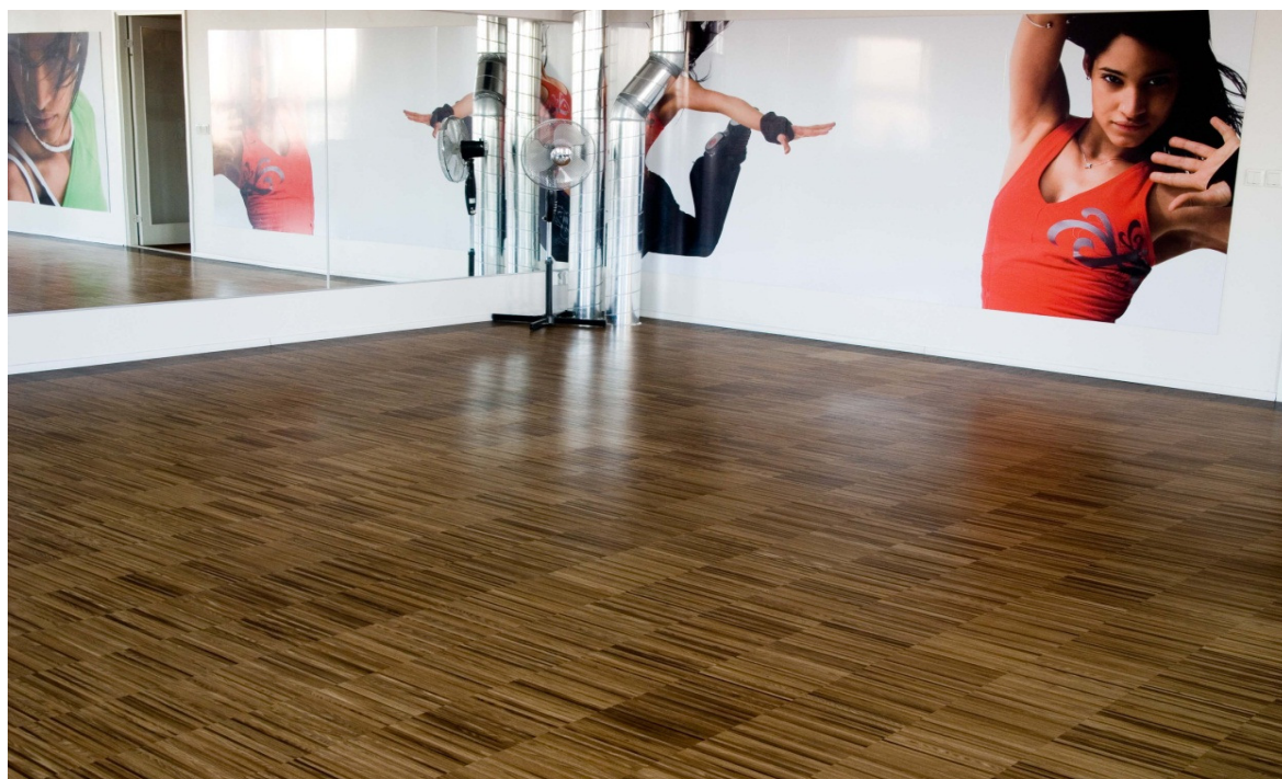
Sports club in Tallinn, Estonia Salsa industrial parquet, medium-treated ash