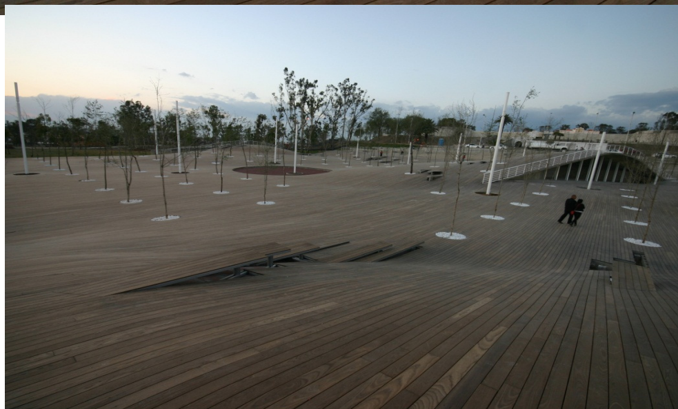
Memorial for the Battle of Cinco de Mayo, Puebla, Mexico Karakum 20x112mm, profile D4sg, end-matched Total volume of the project: ca 6500m 2