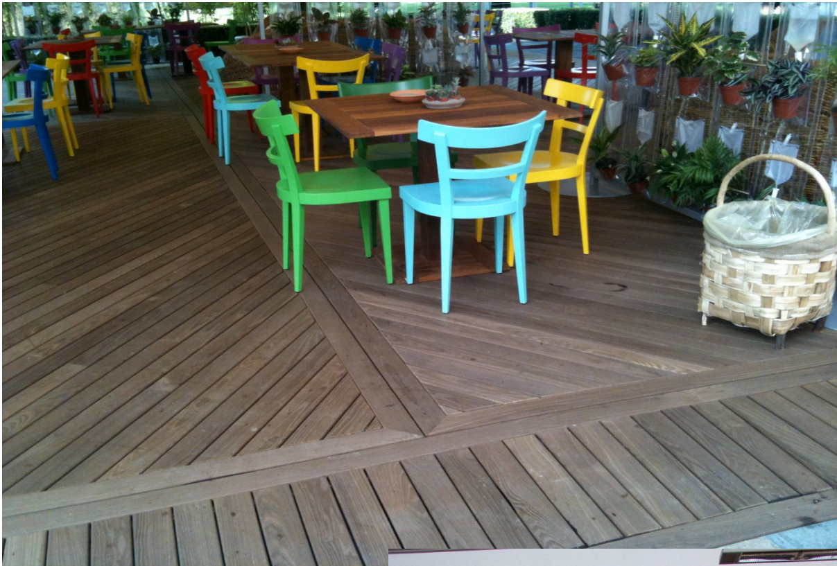
Cafeteria in Italy Karakum 20x112mm, D4sg