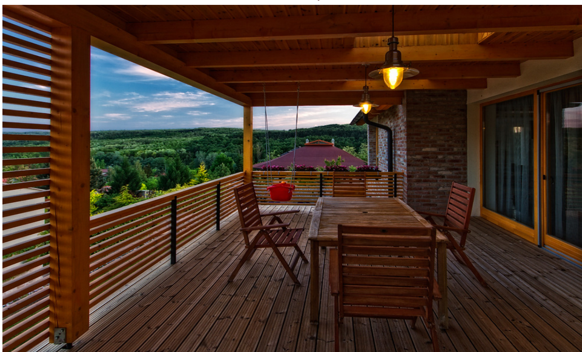
Private villa in Hungary

Arizona 26x115mm, D30, thermo-treated pine