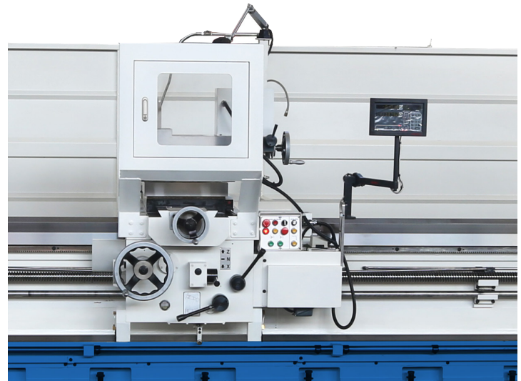
Heavy Duty Carriage shown with optional digital readout

The Big Swing Hollow Spindle Lathes also come equipped with a steady rest, follow rest, taper attachment, hardened and precision ground bedways, front and rear chucks, and many more options are also available.