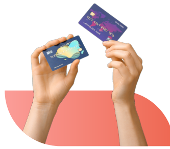
Modernized & personalized card Issuance