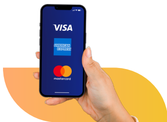
Connection to global / regional networks