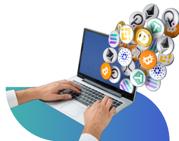
Blockchain and digital currency readiness