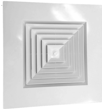
BORDERED HT-2X2-BSPL BOOT DIAMETER OPTIONS