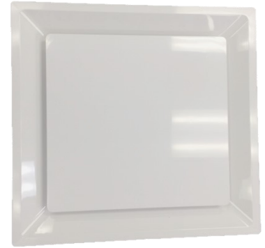
PLAQUE HT-2X2-PSPL BOOT DIAMETER OPTIONS