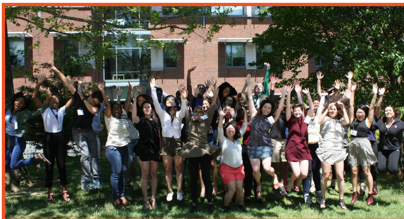
2018 - 19 Project 55 Fellows 'jumping for joy' at Orientation in May, 2018.