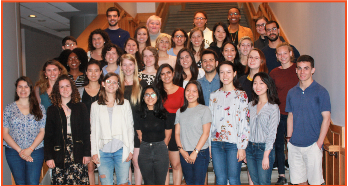
2019 - 20 Project 55 Fellows at Orientation in May, 2019.

The mission of Princeton AlumniCorps is to mobilize people, organizations, and networks for the public good.