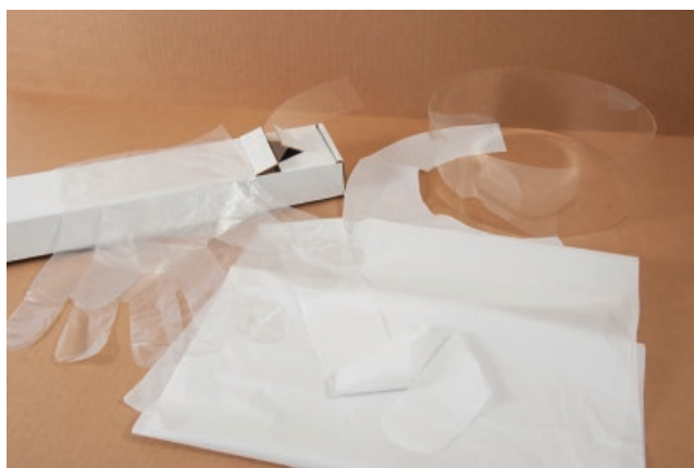
PE gloves, apron and cake wrap / collar and special custom inner dispenser box.