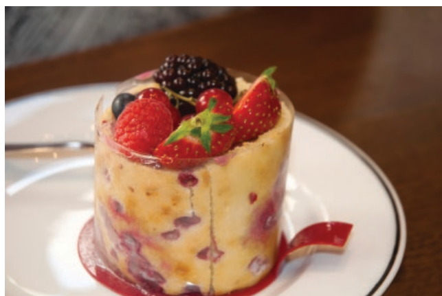
Cake wrap / collar in use.

**call A-ROO company about customizing our bags + order cake wraps