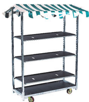
Canopy Fabric TROLLEY-CC-53"X22"X75" Canopy Frame TROLLEY-53"X22"X75"-CANOPY FRAME

Our Plant Trolleys are built from sturdy metal frames with your choice of surface treatment. Hot Zinc (hot dip galvanizing), Cold Zinc (electro-galvanizing), powder coated paint (entire part) or hand painted (for specific area). Anodized finishes are also available.