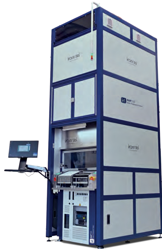
Real Image of KT-RAPTER (vertical system)*

Users can define and configure a diverse array of test scenarios, encompassing both moving and stationary objects. These tests can be integrated with antenna pattern measurements, facilitating sensor calibration and performance verification in a simultaneous manner.