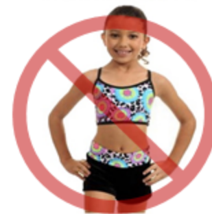
Crop Tops/ Sports Bras