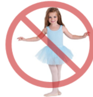
Loose Hair and Unattached Ballet Skirts

Dance Quest strives for a spirit of excellence in an atmosphere of encouragement.