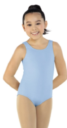
Level 1 Beginner/Intermediate