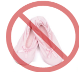
Satin Ballet Slippers