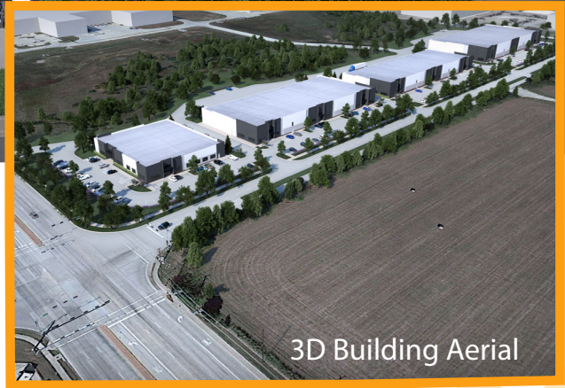
3D Building Aerial