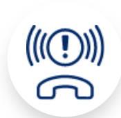
Miss call alerts