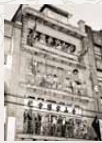
Province Newspaper, Vancouver Public Library #41625