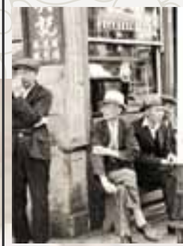
Vancouver Public Library #17080