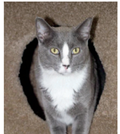
Sylvan was abandoned at a park and is available for adoption at Happy Tails