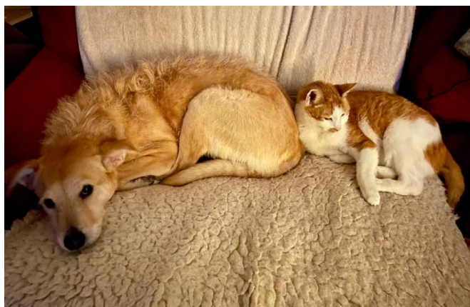
(Pictured is Happy Tails kitty Kenny with resident dog Skeeter)

Your new cat may be one of those rare animals that makes himself/herself right at home anywhere. If so, you're lucky! Most cats take time to adapt to new