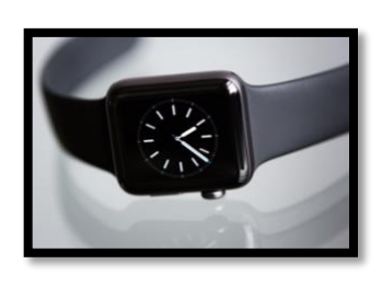
ITEM #4: An Apple Watch