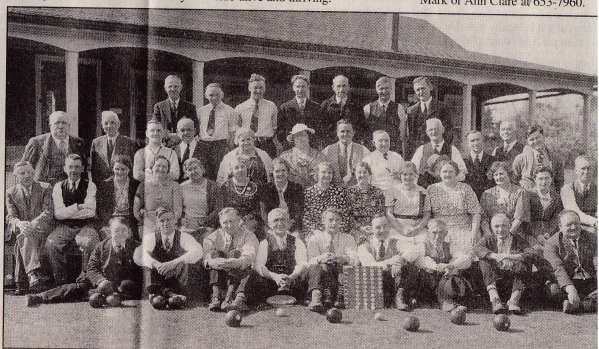
The original members of the Preston Lawn Bowling Club pose for a photo in the 1930s.