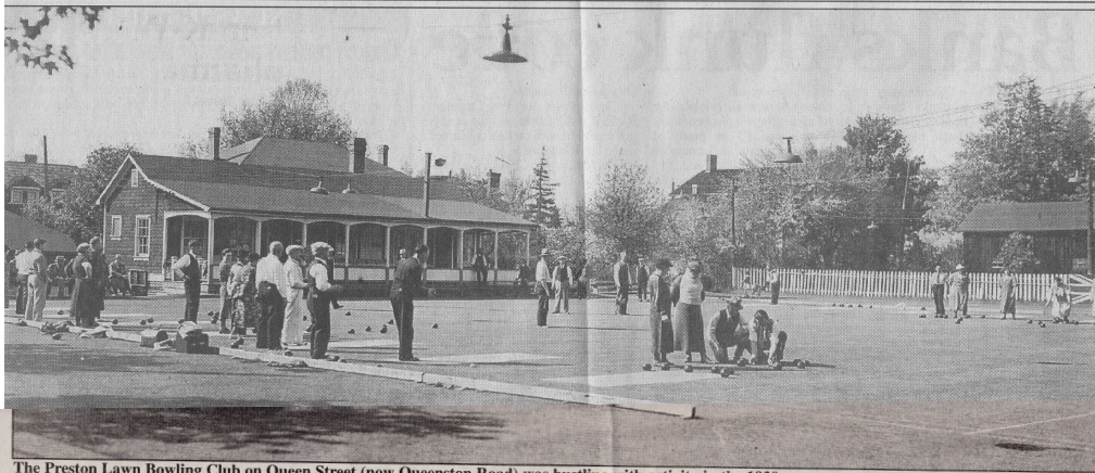
The Preston Lawn Bowling Club on Queen Street (now Queenston Road) was bustling with activity in the 1930s.