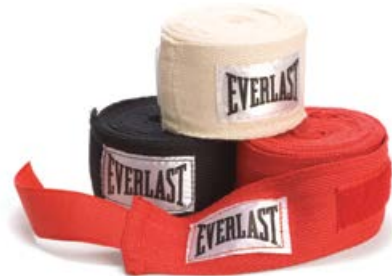
120" 3 PACK 4455-3-120