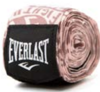
ROSE GOLD MOTIVE P00002915