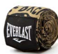
GOLD MOTIVE P00002916