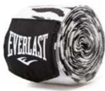
WHITE GEO P00002914