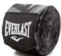
BLACK GEO P00002913