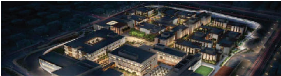
Arab Centre for Research and Policy Studies

We are aiming to increase the international projects value in the coming years.