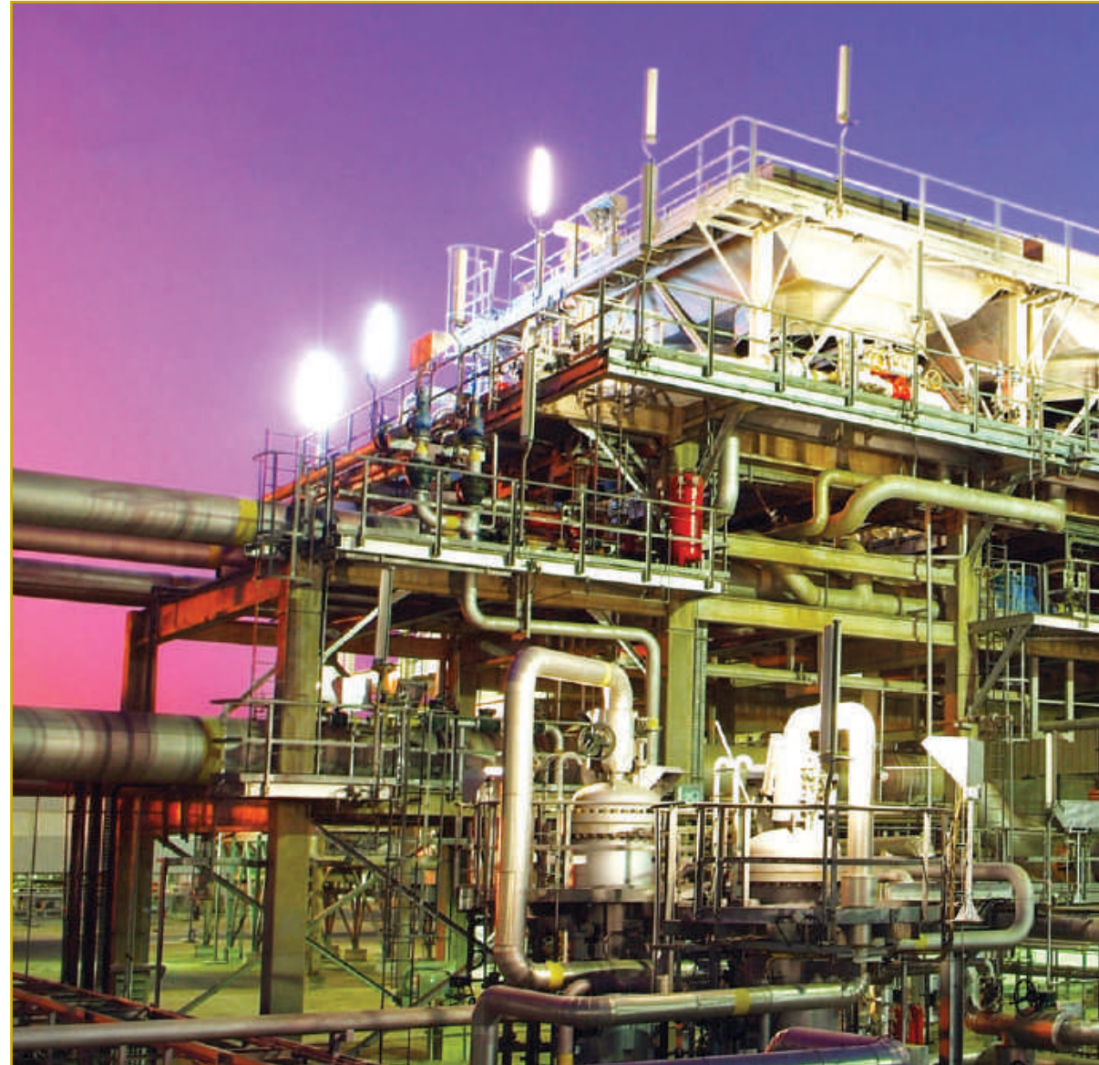
Construction of Crude Export Line