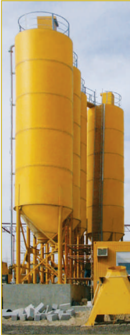
Ready Mix Concrete Plant