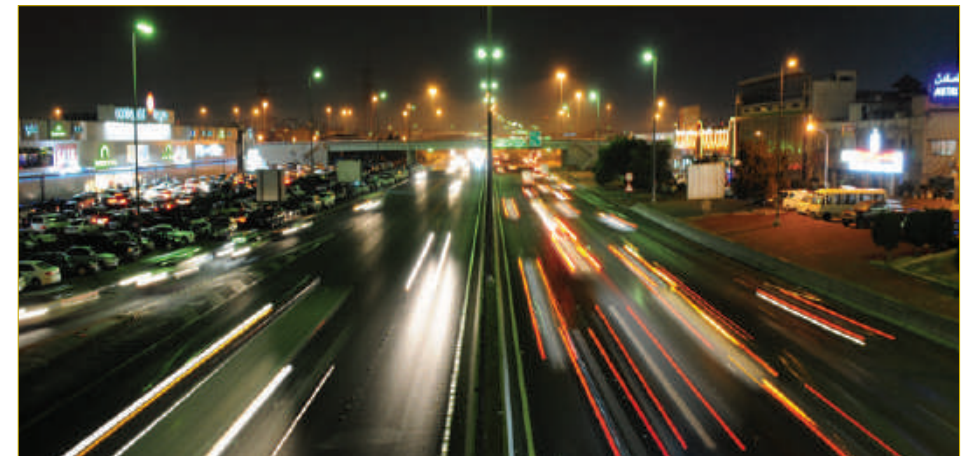
Al Ghazali Expressway Project

Major works comprise of: asphalted roadway paving, construction of six major prestressed / cast-in-site post tensioned concrete bridges and three pedestrian bridges, retained underpass, stabilized earth walls, earth moving works, concrete barriers, box culverts, relocation of water, gas and sewage lines, construction of services such as telephones, street lighting, traffic control system, storm water drainage, warning signs, guide signs and road marking, chain link fencing, overhead sign gantries and others.