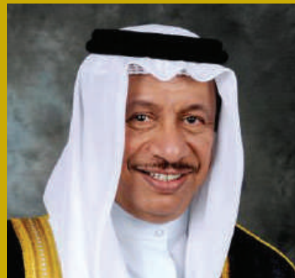
His Highness Sheikh Jaber Mubarak Al-Hamad Al-Sabah The Prime Minister of The State of Kuwait