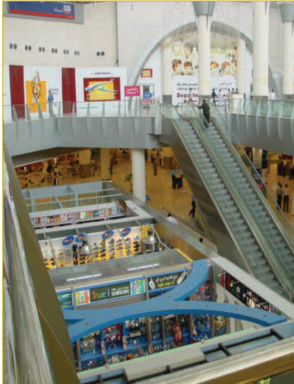
Kuwait International Airport Project