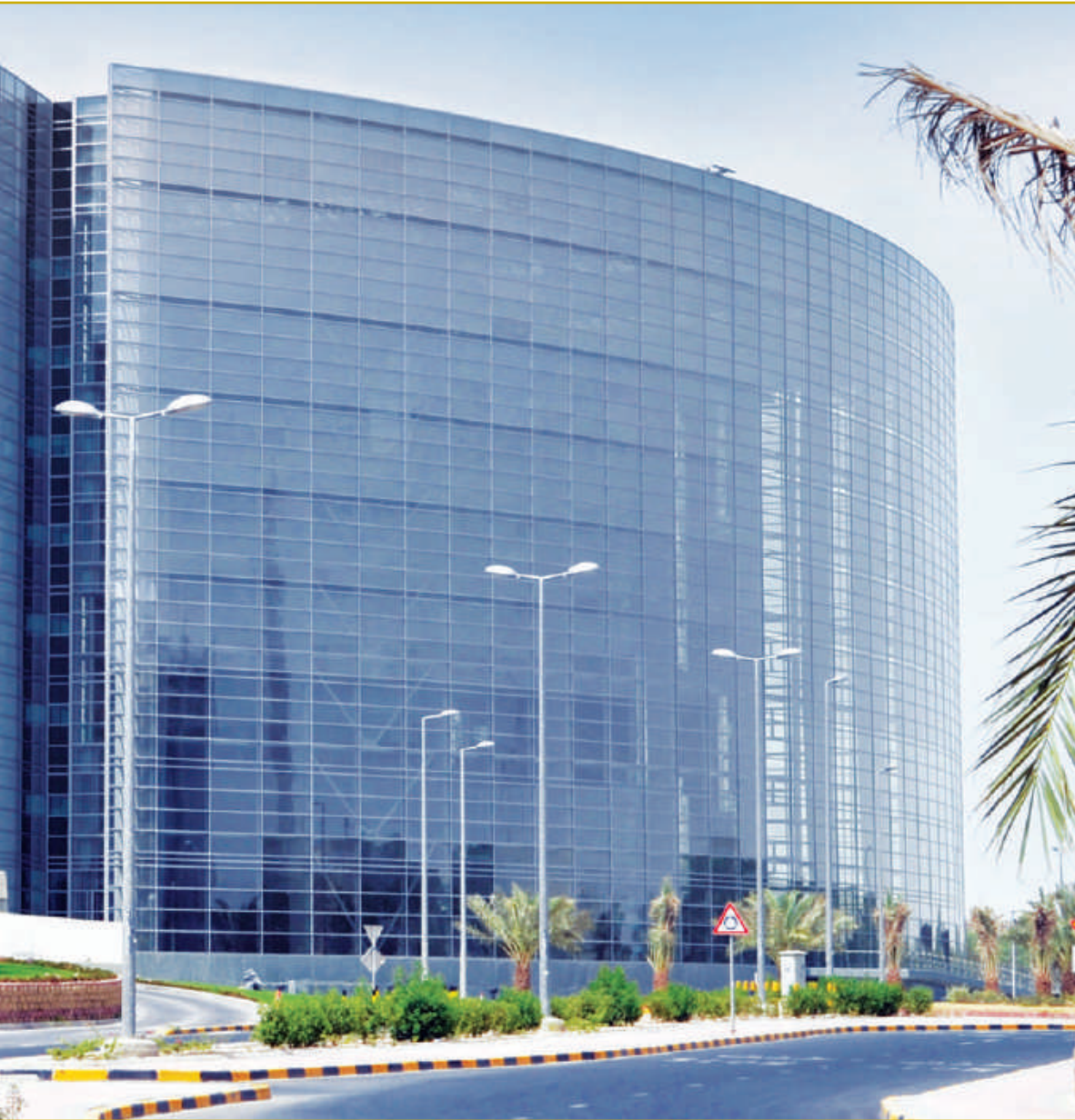
State Audit Bureau Headquarter – Kuwait Project

Owner: Hamad Al-Saleh Al-Homaizi Grandsons Real Estate Co.