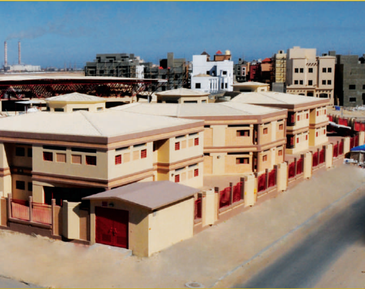
Jaber Al Ahmed Residential Project - Kuwait