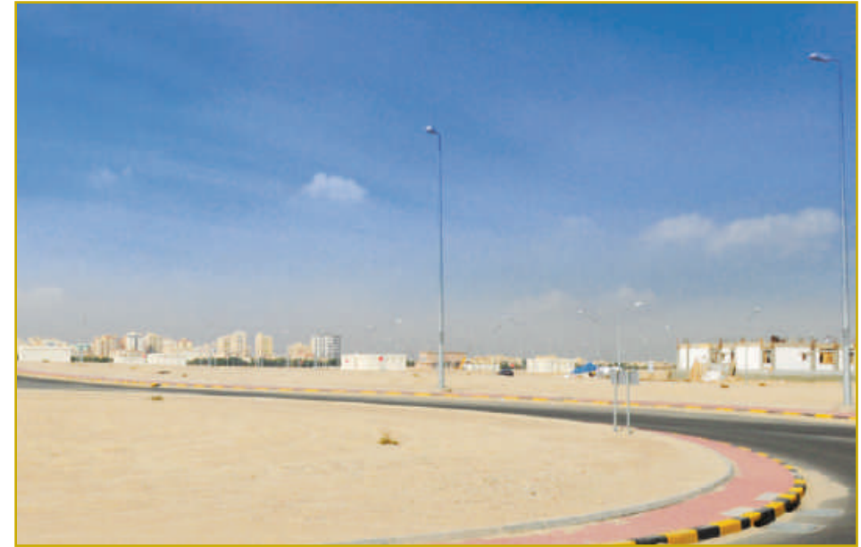
South Surra, Al Siddiq Dahiya Project