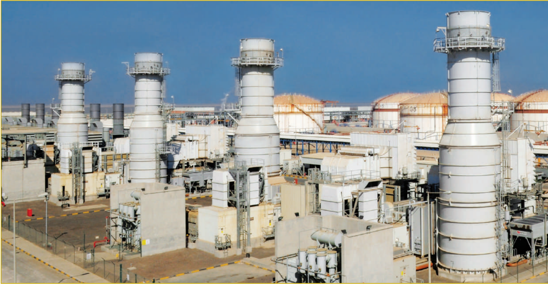
Subiya Power Station Project