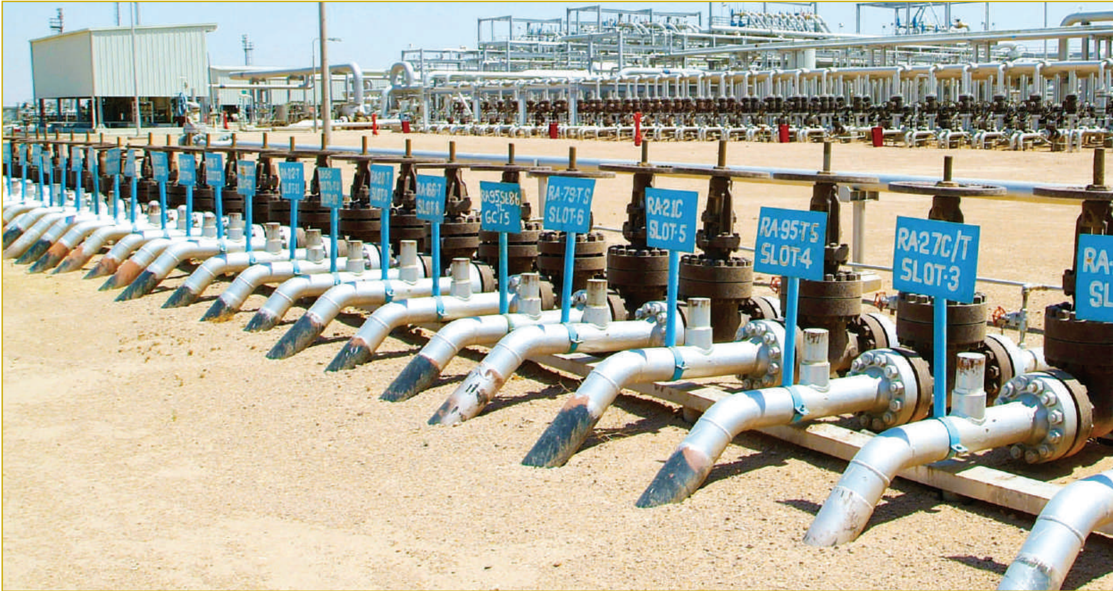
Project for Establishing Oil Lines in North Kuwait