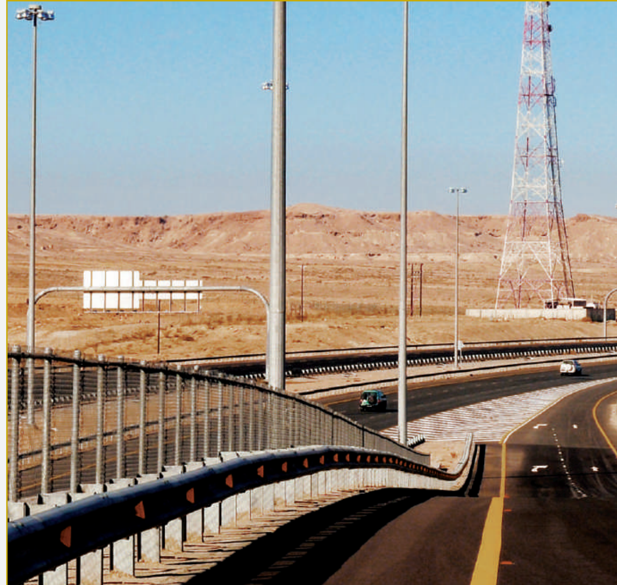
Subiya Highway Project