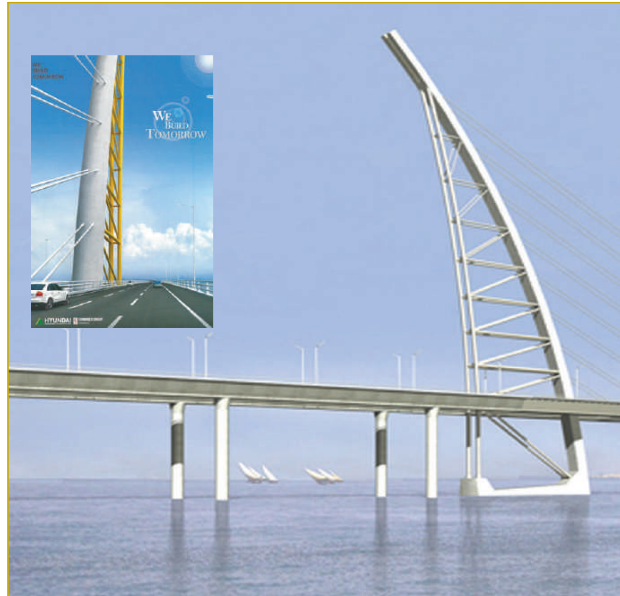
Sheikh Jaber Al-Ahmad Bridge Project