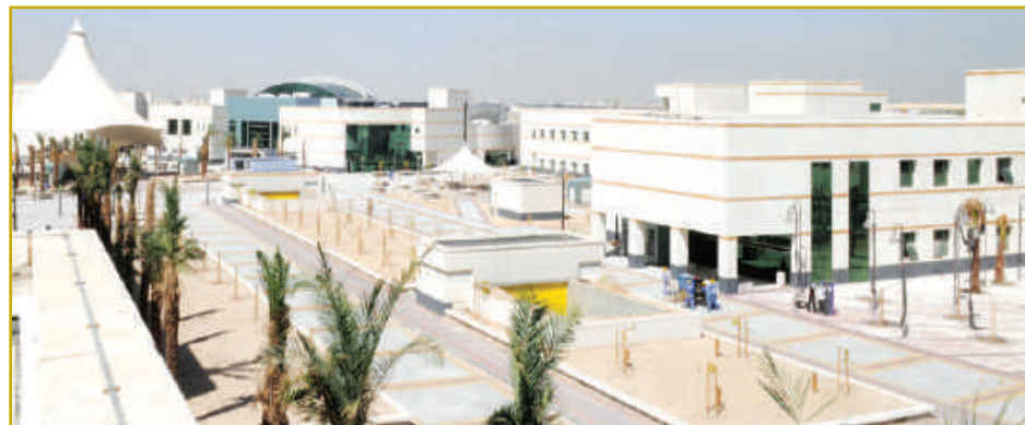
College for Basic Education, Boys Campus, Ardiya