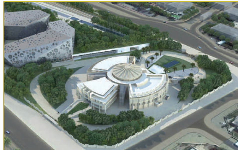
Developing and Rehabilitation of Al Salam Palace Project