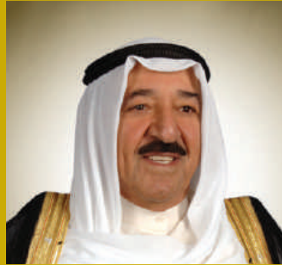
His Highness Sheikh Sabah Al-Ahmad Al-Jaber Al-Sabah The Amir of The State of Kuwait