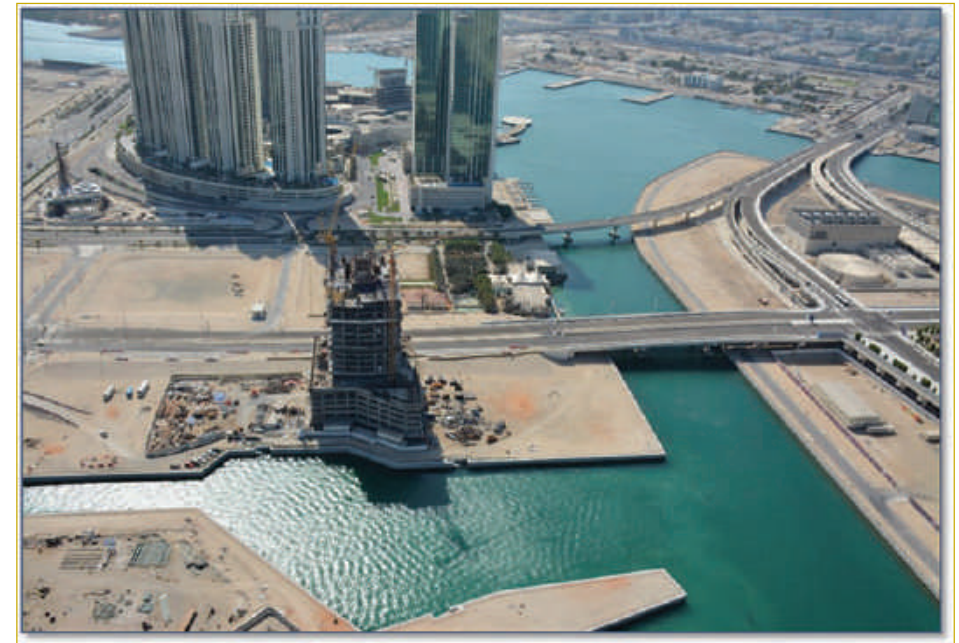
Infrastructure work at Al-Reem Island - Abu Dhabi

Owner: Ministry of Public Work Project Value: AED 111,442,000/- (Equivalent US$ 29,910,000/-) Duration: 540 days Completion Date: 16.09.2016