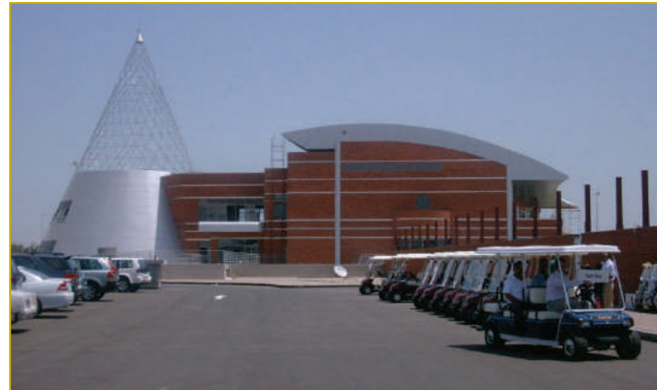
Golf Club Project