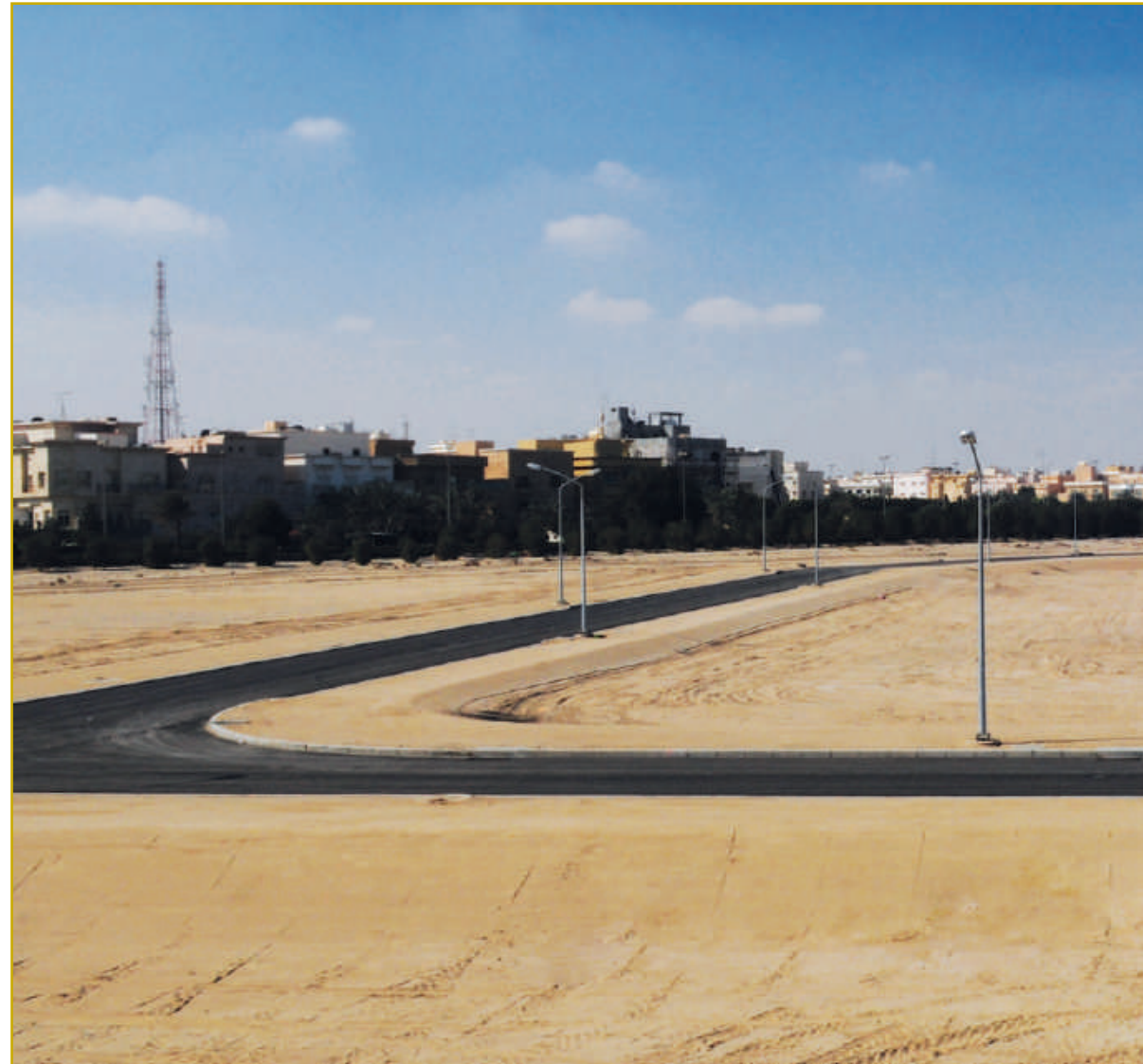
Al Qurain (Abu Fatira) Project