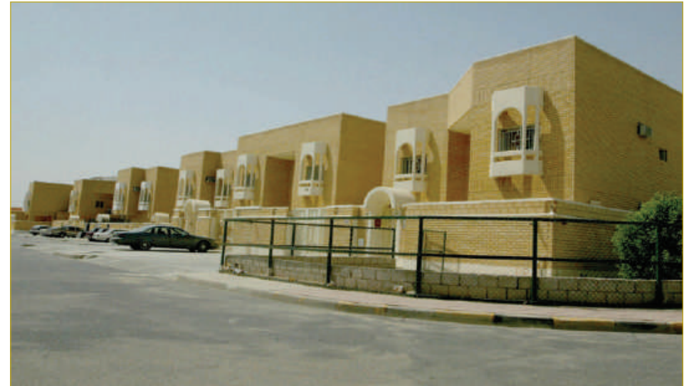
Umm Al Haiman Residential Project