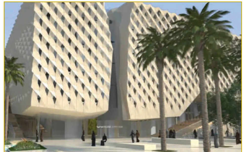
Faculty of Arts and Education Project