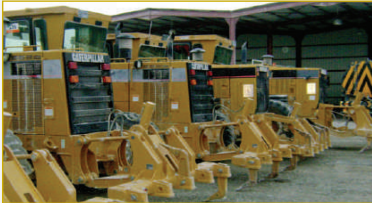
Vehicles and Equipment

The company owns fully-equipped mechanical workshops able to carry out all necessary maintenance and repairs for our fleet of vehicles, equipment and plant. The workshop is built over an area exceeding 10,000 square meters. Our equipment and vehicles include earth moving equipment, road paving and construction equipment, and pumping equipment together with numerous other transportation vehicles. These are all controlled, managed and maintained by our own specialized team of technicians to ensure their efficient and reliable operation.