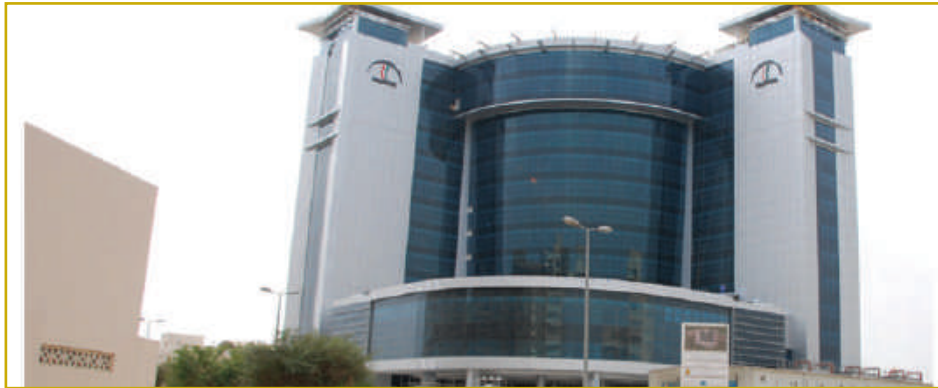
Construction and Maintenance of the Headquarters for Manpower and Government Program