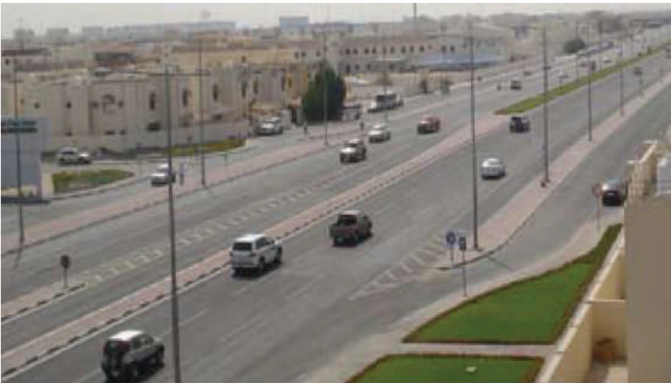
Infrastructure and Construction of Mesaimeer Street - Qatar