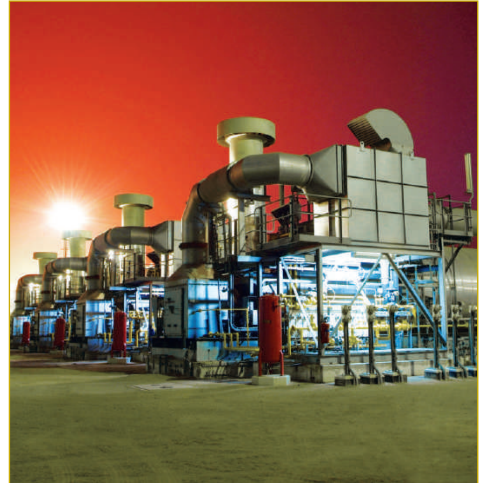
Bulk Handling Facilities for Production Chemicals in South-East Kuwait, West Kuwait and North Kuwait