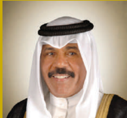
His Highness Sheikh Nawaf Al-Ahmad Al-Jaber Al-Sabah The Crown Prince of The State of Kuwait