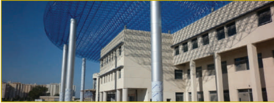
Construction and Maintenance of Lab. and Workshops of the College of Technology