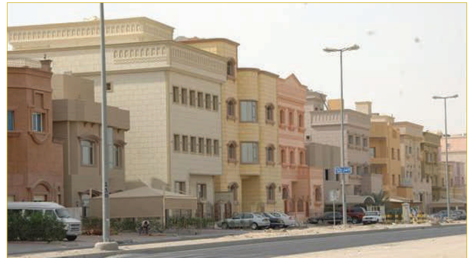
Sabah Al Ahmad Residential Project