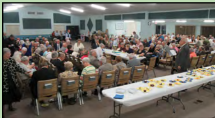
Celebrating With Cake & Ice Cream