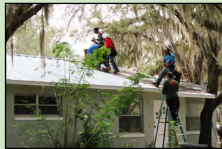
21 Matthew St. — New Roof

of residents and friends of Maranatha Village. There are other projects that could be realized in the future as we look toward improving our remarkable Village. A recent survey of residents and guests identified over 30 suggestions for various possible projects,