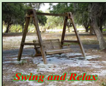
Swing and Relax