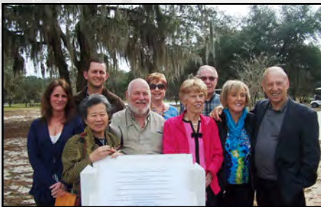
The Conway Family