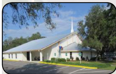
Maranatha Baptist Church