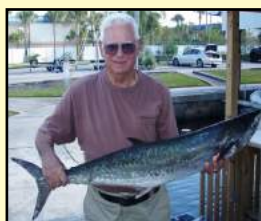
King Mackerel—22-24 Pounds

If you like fishing, then Sebring is a great place to live as fishing in either the Atlantic Ocean or the Gulf is only a short drive away. Fresh water lakes abound in the area of ferreng great year-round fishing.