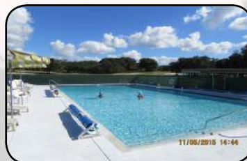
Maranatha Swimming Pool