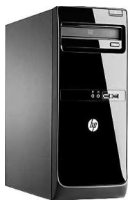
New computer controlled lights, with keyboard, and monitor for church lighting.