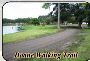
Doane Walking Trail