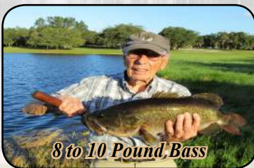
8 to 10 Pound Bass