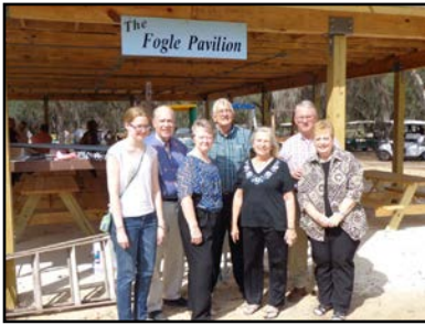
The Fogle Family