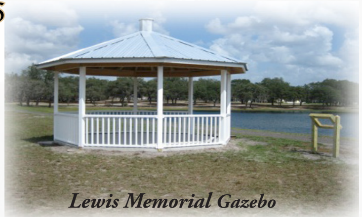
Lewis Memorial Gazebo

Maranatha Village enjoyed the unique experience of dedicating two great additions to its grounds during the second week of March 2015.