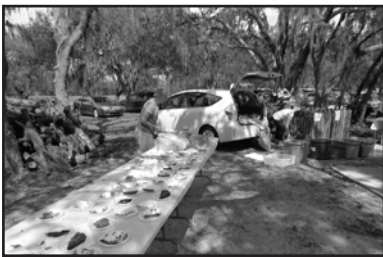
Hot Dog Buns Waiting!

The Village Hot Dog Roast was held on March 11 th in Memorial Park from 11:30 AM to 12:30 PM. It was a beautiful sunny day with a breeze and a temperature of 89 degrees. The Hot Dog/