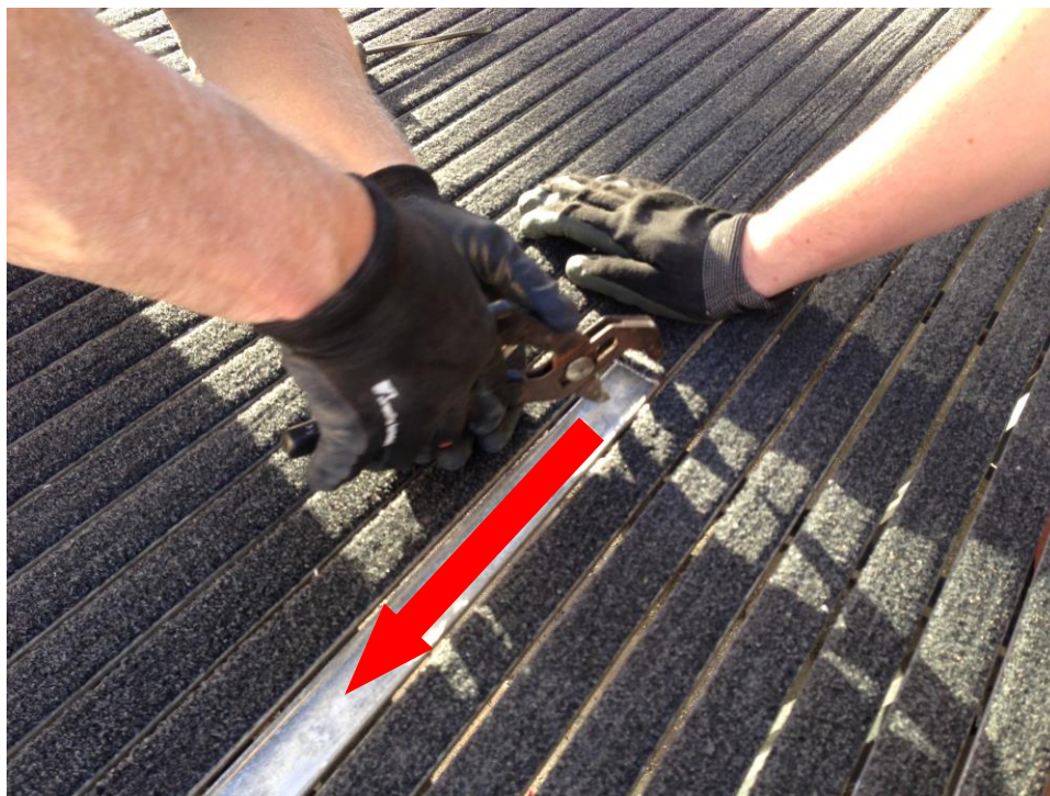
Pliers can be used to help pull the carpet inserts.