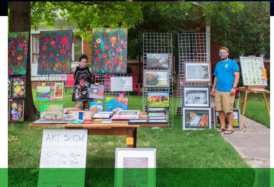
(From top) Oklahoma City Ballet's production of Firebird ; Oklahoma Visual Arts Coalition Art Crawl