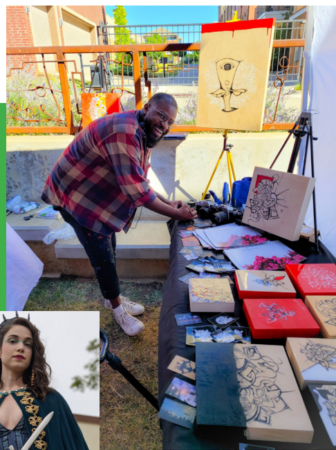
(left) Oklahoma Shakespeare's production of Macbeth ; (below) Sooner Theatre's production of Chicago