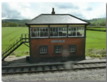
■ Refurbishment of Toddington Signal Box windows