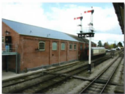
■ New workshop and volunteer welfare facilities at Toddington

Financial assistance was provided to enable the Construction of Broadway station through a combination of appeal and Grant Funding.