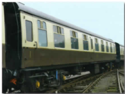
■ Purchase of British Railways Mark 1 coaches for use on the Railway