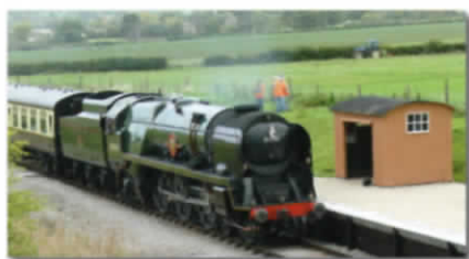
■ Hayles Abbey Halt ■ The Tim Mitchell Building including Terry Creswell room at Winchcombe

The Trust has supported the development of the Railway through Grant Aid from its available funds or by promoting appeals for specific projects. Examples of Grant aided projects are: