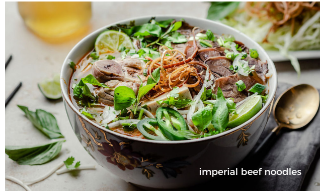
imperial beef noodles