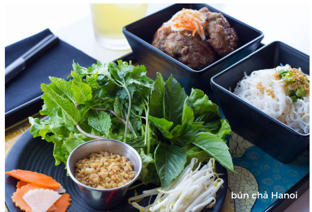
bún chả Hanoi