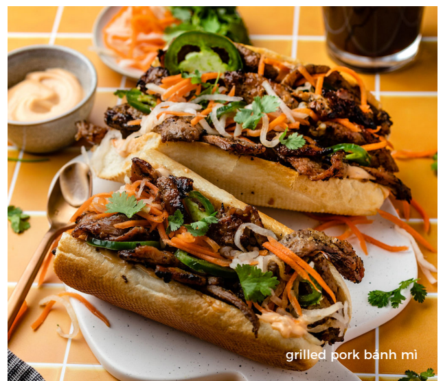
grilled pork bánh mì