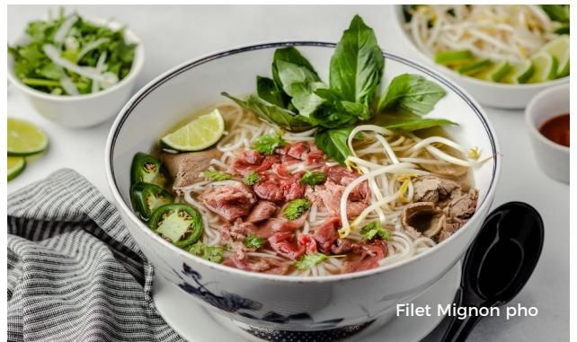
Filet Mignon pho