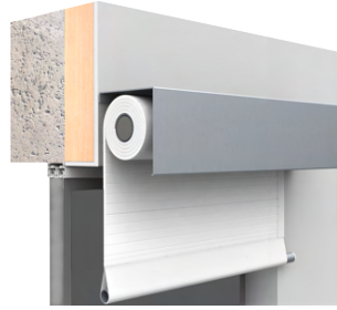
Roll-Ups mount above the frame