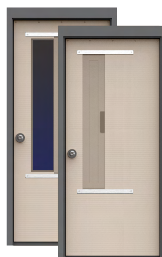
Fixed Panel Door Shields