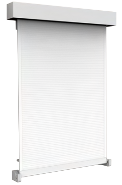
Locked into mounts