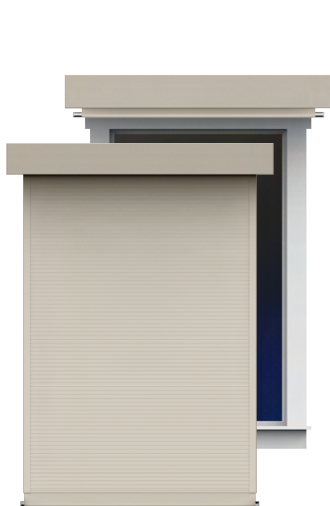
Roll-Up Window Shades