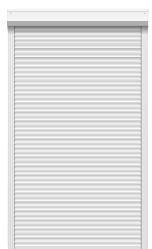
Hallway Barriers and Dividers