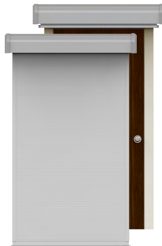
Roll-Up Door Shields