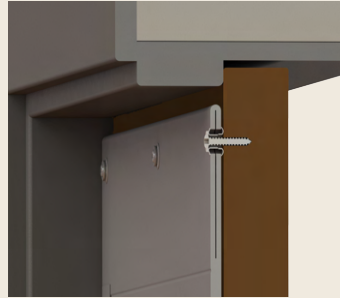
Mount into door slab