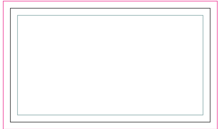
Side Two (Optional)