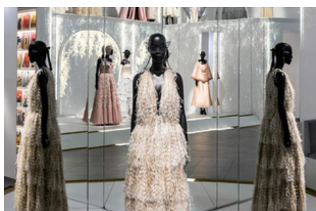
PERMANENT EXHIBITION Galerie Dior