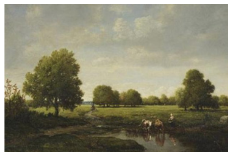
THÉODORE ROUSSEAU, LA VOIX DE LA FORÊT Petit Palais