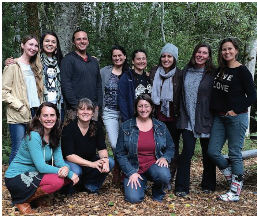
Several members of the Tend, Gather and Grow team in 2016.