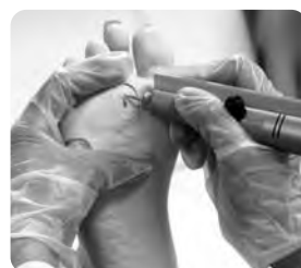
Trimming and removal of the corn