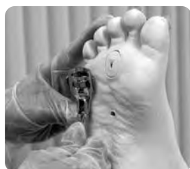
Trimming and removal of the callosity