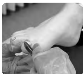
Trimming and clipping of toe nail