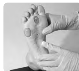
Observations of the anatomical positions