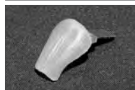
Toe nail A (thickened ingrown nail)