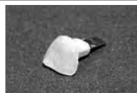
Toe nail B (thickened nail with ringworm)