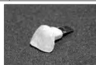
Toe nail B (thickened nail with ringworm)