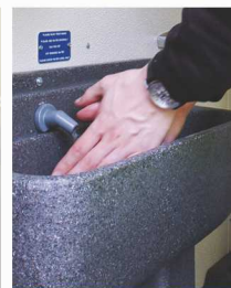
Delivery of hot water