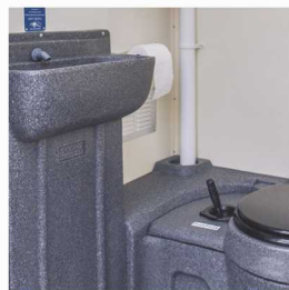
Toilet wash area