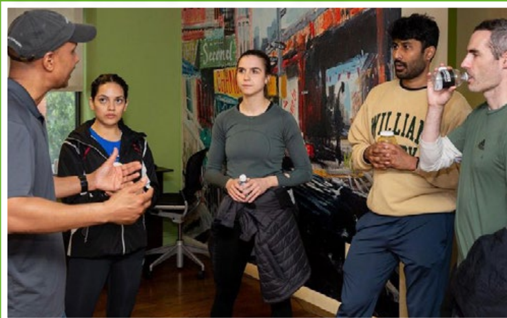
2023 Spring Run for Justice