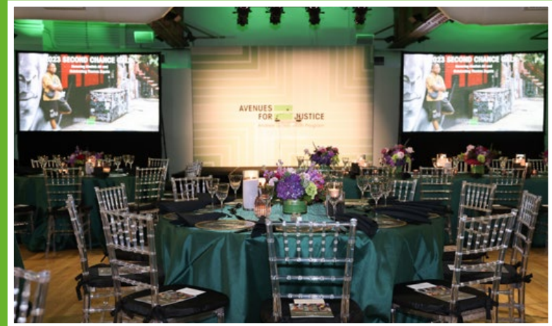
2023 Second Chance Gala