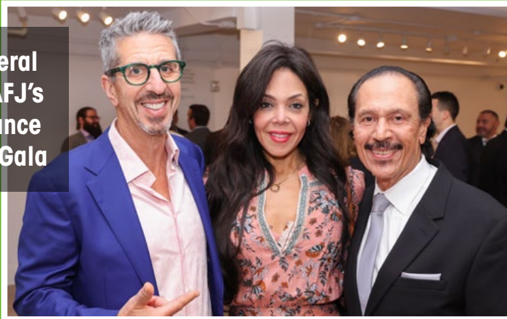
2023 Second Chance Gala

NYS Attorney General Letitia James at AFJ's 2023 Second Chance Awards Dinner & Gala