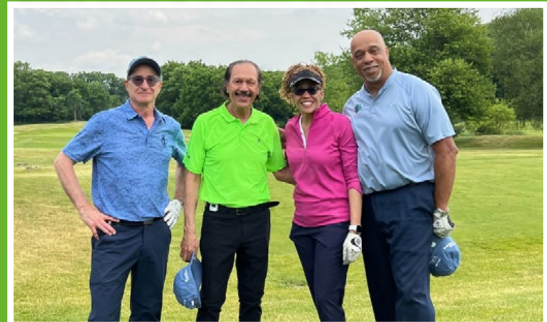
2023 Angel Golf Classic