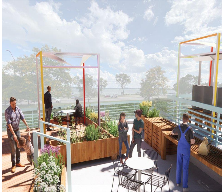
Another rendering from Saiki Design(Saiki Design)

Saiki Designs is a landscape architecture firm based in Madison. They have come up with some renderings of what the space will look like.