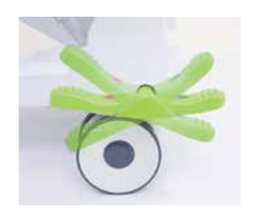
Four casters with central brake

Built-in bed extender increases patient comfort and caregiver efficiency.