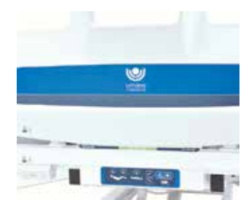
Foot end back-up control on the frame