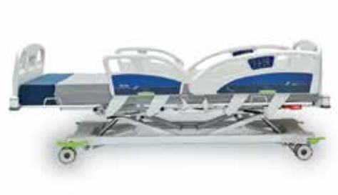
Integrated bed extender to maximize staff efficiency and improve patient comfort