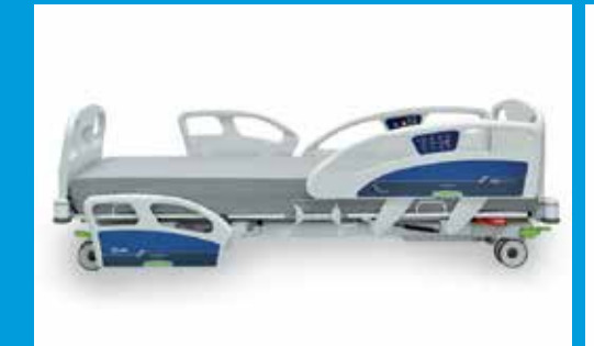
5" under bed clearance for lift and overbed table compatibility even at 10" lowest height

Different graphics are available to suit your facility.