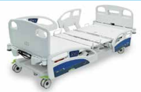
Open architecture for ease of cleaning and simple installation of mattress