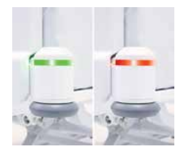
Bed exit side view lights