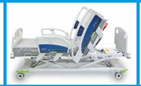
Boostless<sup>™</sup> backrest system prevents patient from sliding down during bed activation and minimizes patient repositioning