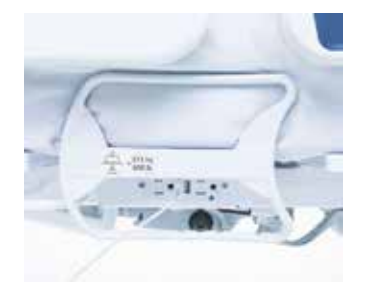
USB power outlets